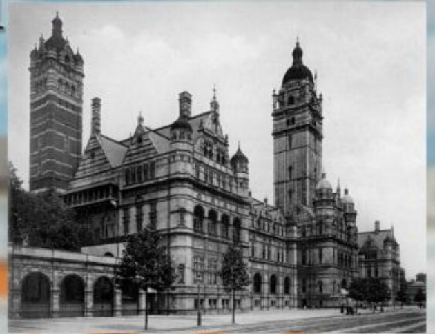
first photo of Imperial College London, 1907

Imperial College London was founded in 1907 on the basis of the Mining Academy (1851), the Polytechnic College (1881) and City & Guilds College (1884)