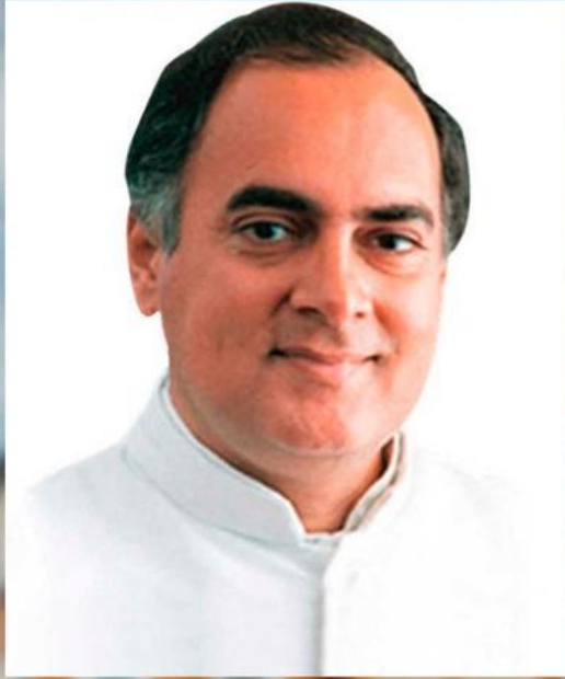
Rajiv Ratna Gandhi Former Prime Minister of India