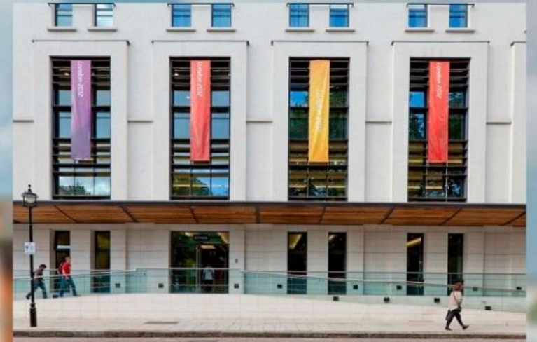
Ethos Sports Centre