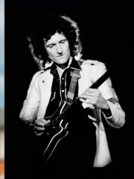
Brian Harold May Guitarist of Queen