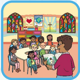
Read or listen to The Easter Story

There are many ways Christian people celebrate Easter. These are just a few Easter traditions .