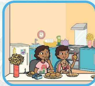
Eat hot cross buns