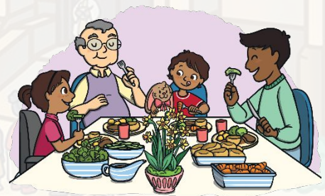
Eat a special dinner