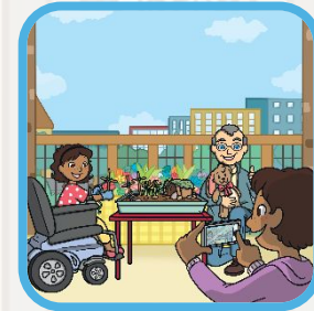
Make an Easter garden