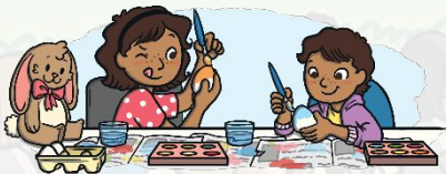
Decorate Easter eggs