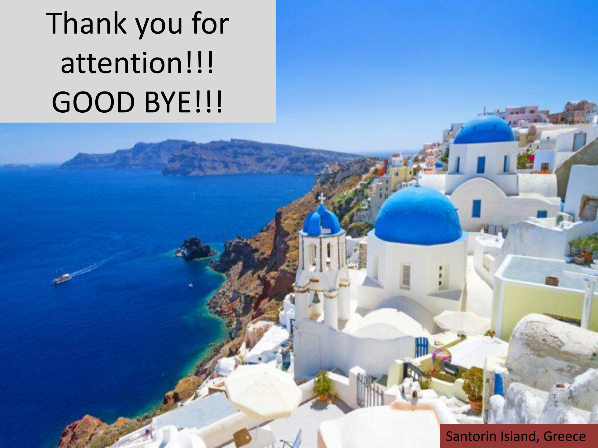
Santorin Island, Greece