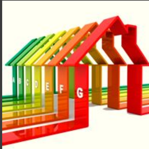
Sales comparison or Market approach