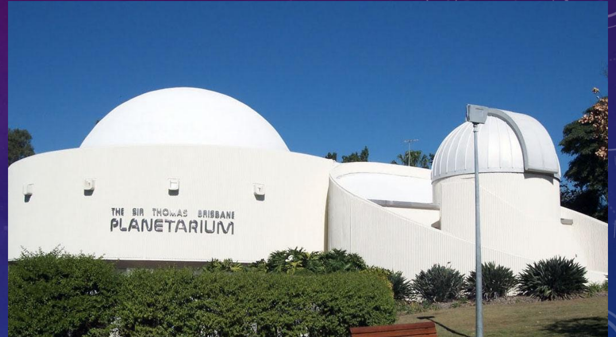
THE SIR THOMAS BRISBANE PLANETARIUM