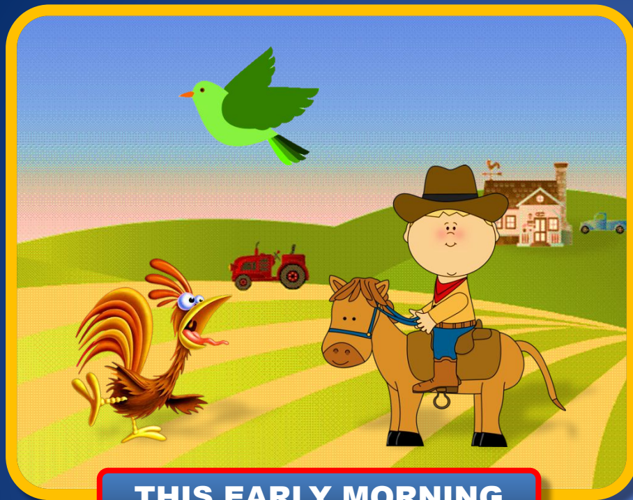
THIS EARLY MORNING