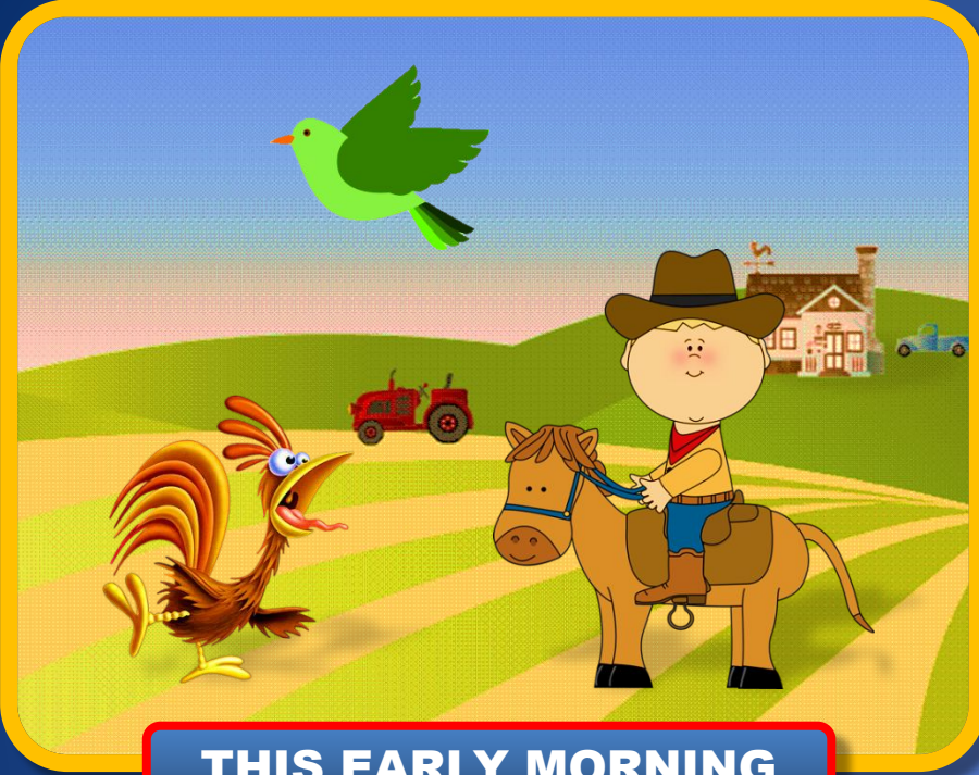
THIS EARLY MORNING