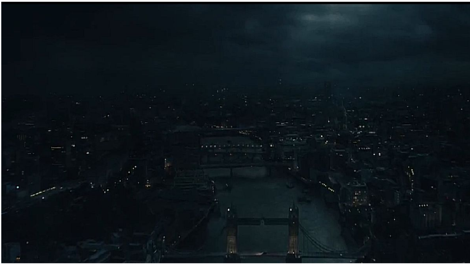
London. Tower Bridge