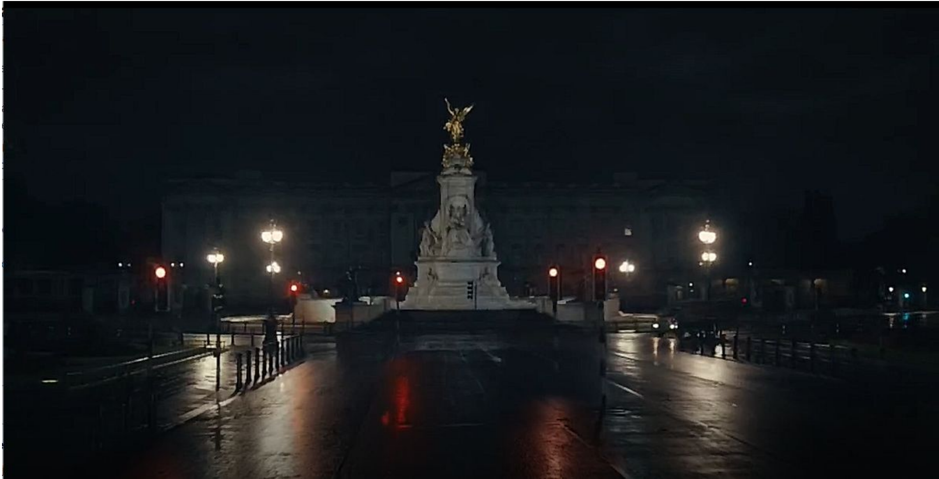
The Victoria memorial. Buckingham Palace