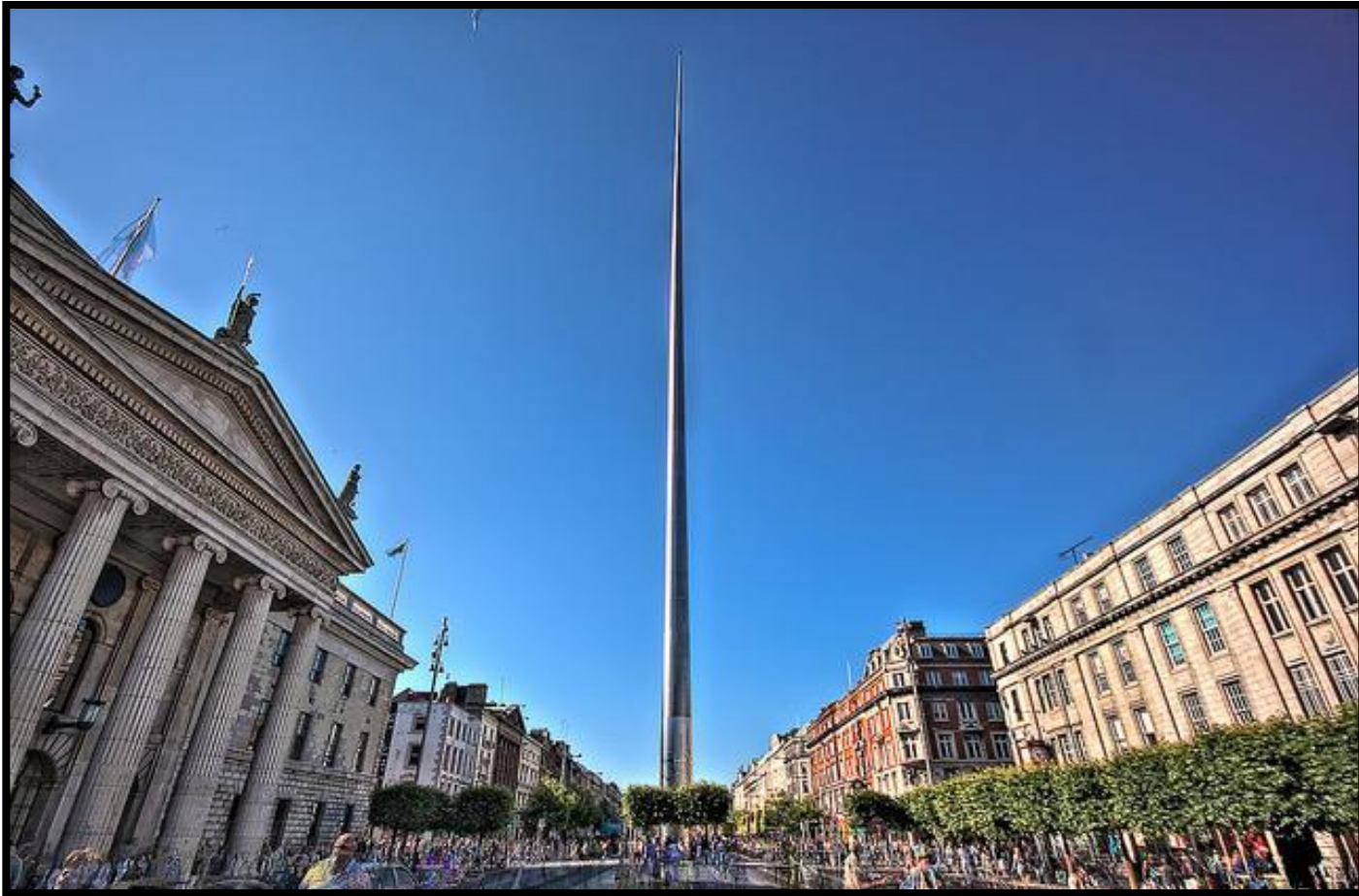
THE SPIRE MONUMENT ON O'CONNEL STREET