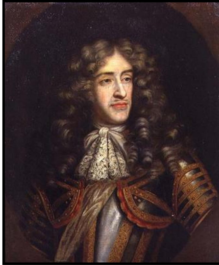
KING OF ENGLAND JAMES II