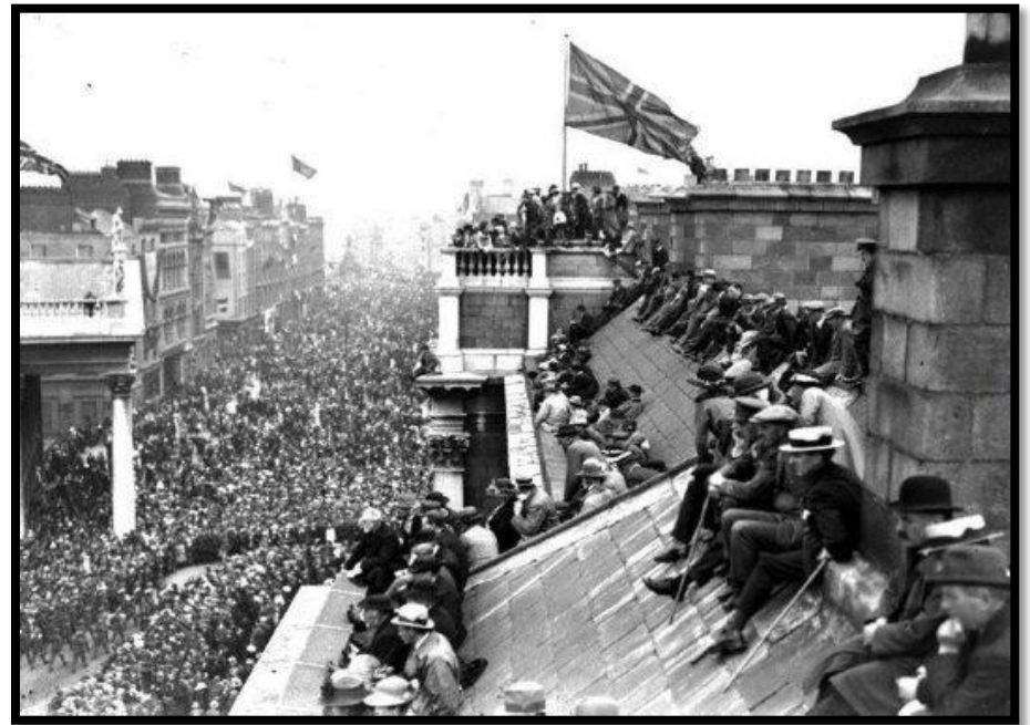
IRISH WAR FOR INDEPENDENCE