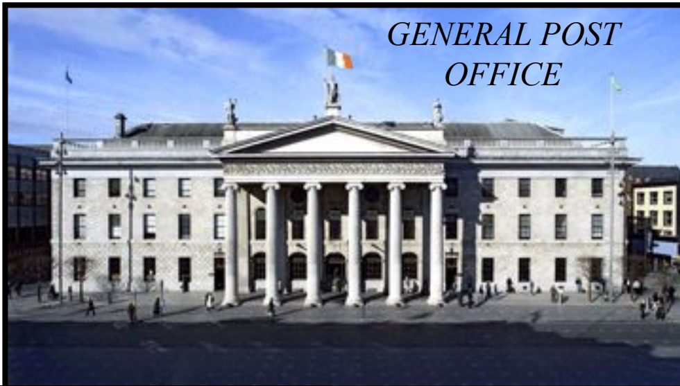
GENERAL POST OFFICE