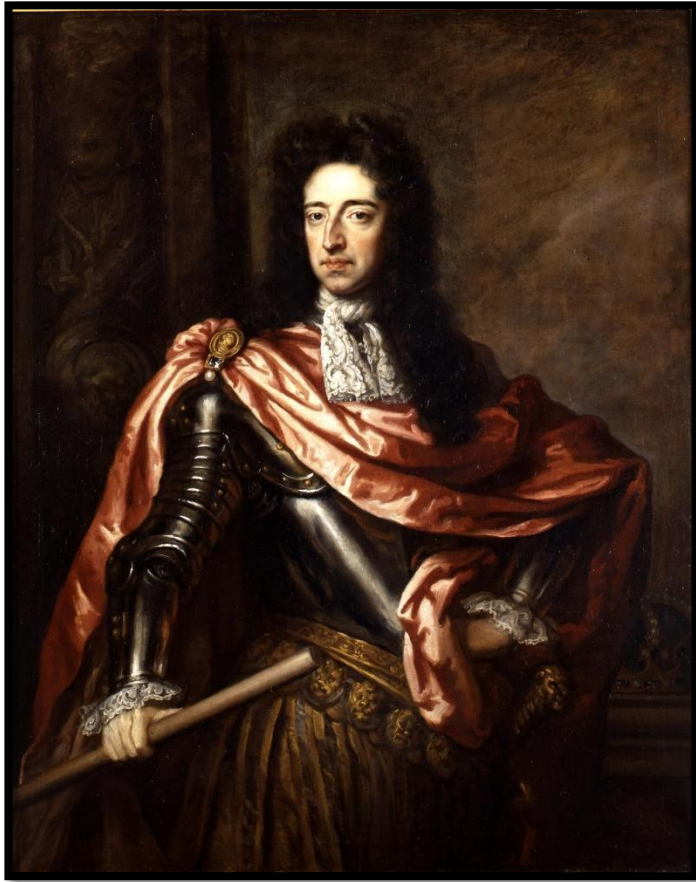
KING OF ENGLAND WILLIAM III