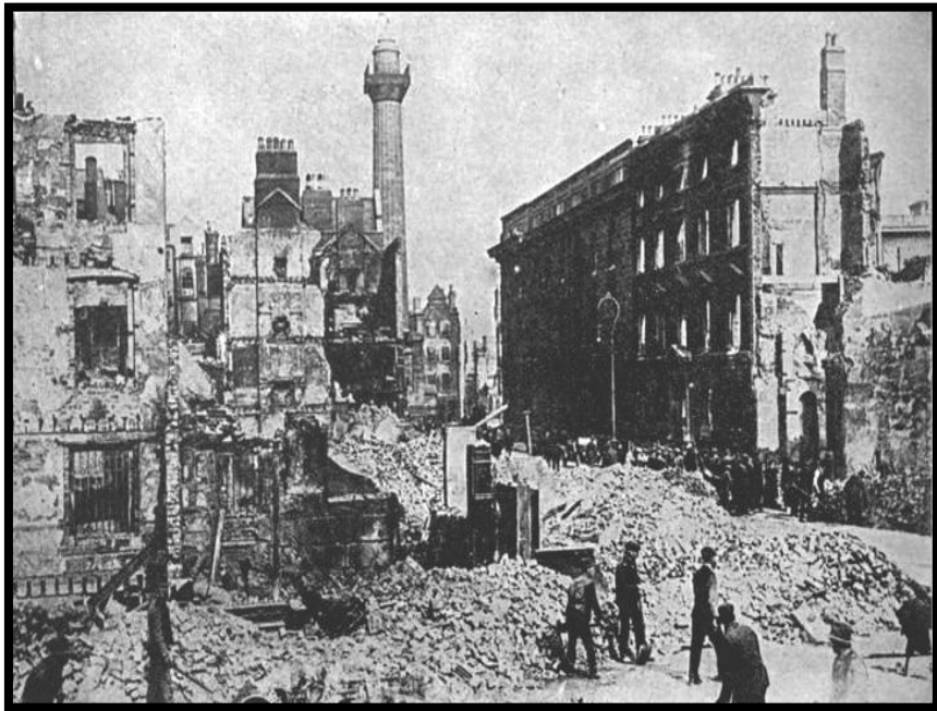
EASTER RISING, DUBLIN