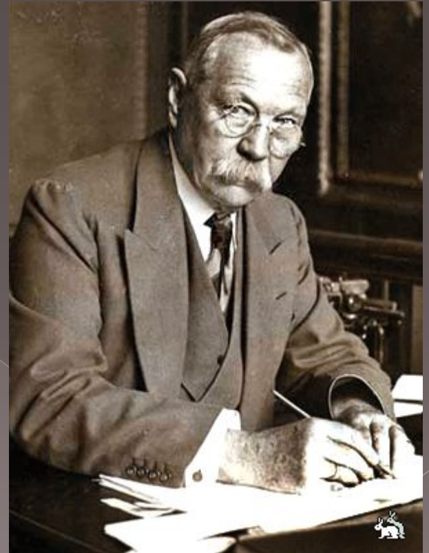
Sir Arthur Ignatius Conan Doyle