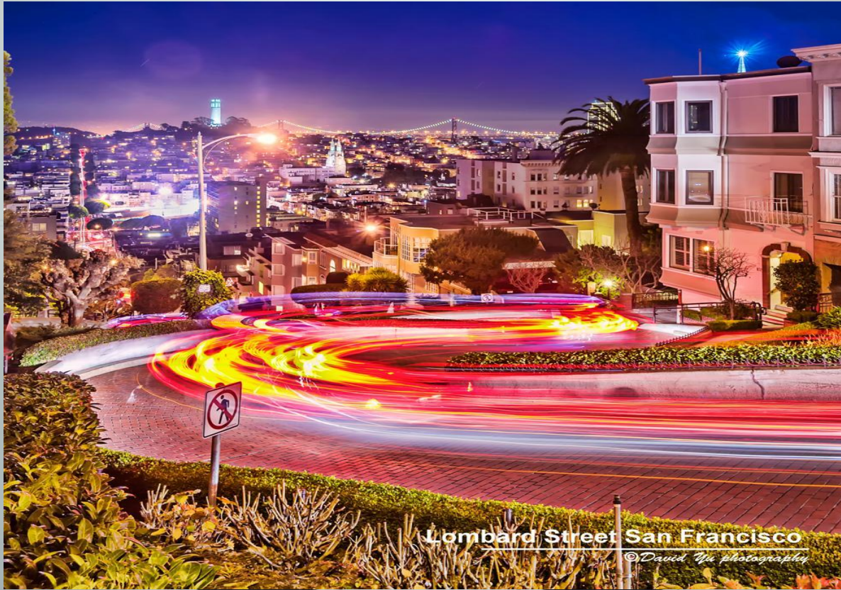
Lombard Street San Francisco

Because of these turns, the street received the status of the most winding in the world.