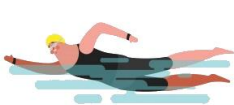
Freestyle (Crawl) - 1.5m/s