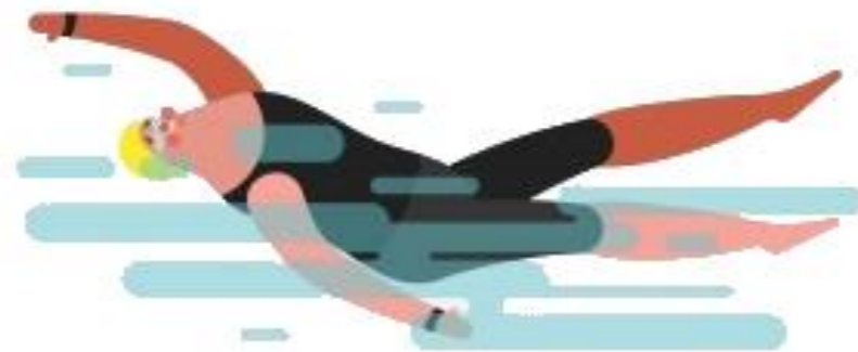
Backstroke - 1.3m/s