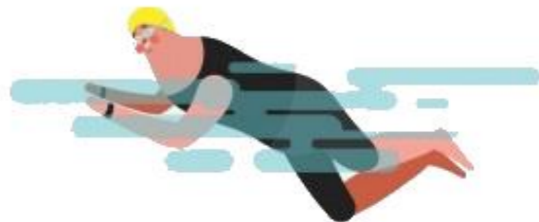
Breaststroke - 1.0m/s