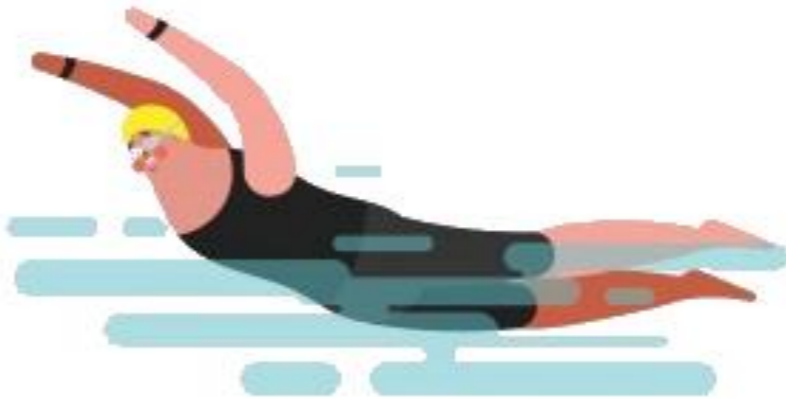
Butterfly - 1.2m/s