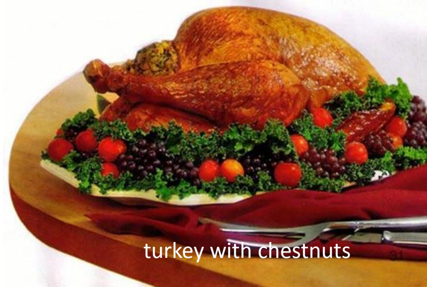
turkey with chestnuts