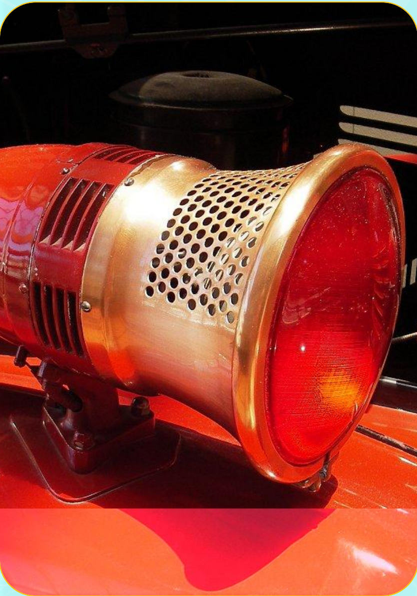
a fire truck siren