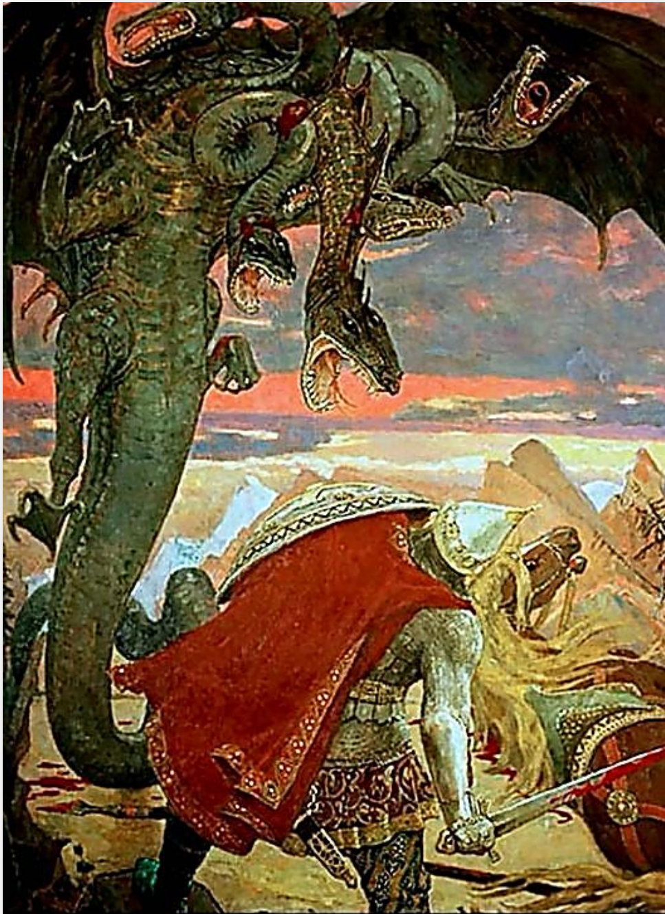
В. Васнецов. БОЙ ДОБРЫНИ НИКИТИЧА С СЕМИГЛАВЫМ ЗМЕЕМ ГОРЫНЫЧЕМ