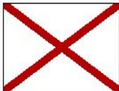
Cross of St. Patrick (Ireland)