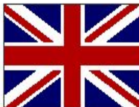
Union Jack (since 1801)