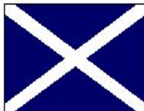
Cross of St. Andrew (Scotland)