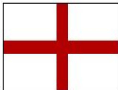
Cross of St. George (England)