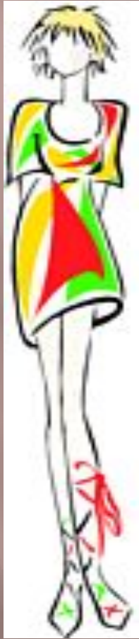
She is slim.