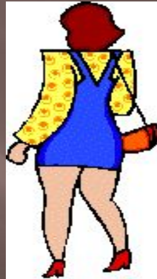
She is fat.