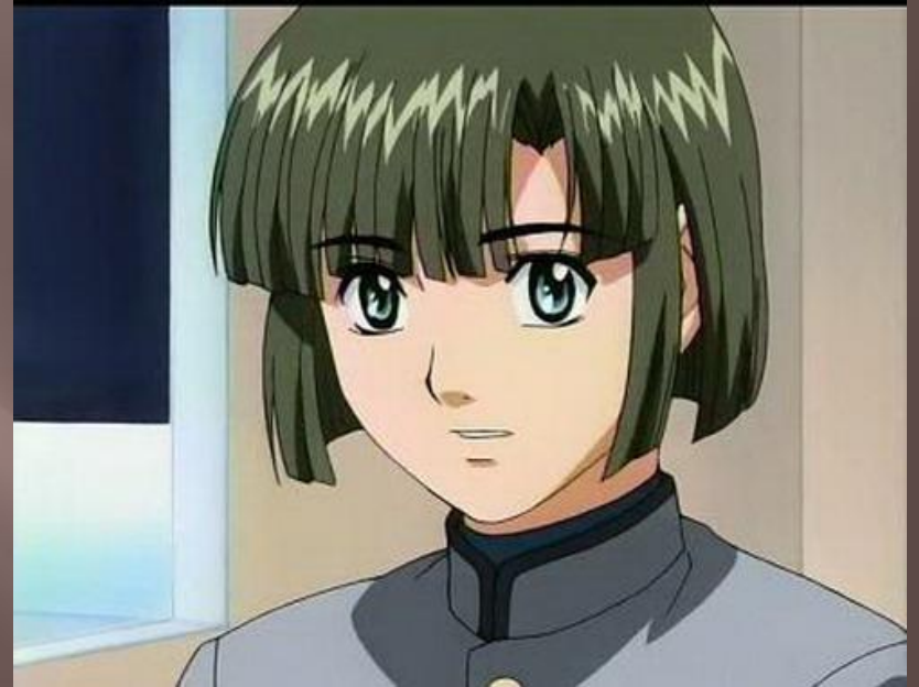
Her hair is short, straight and black