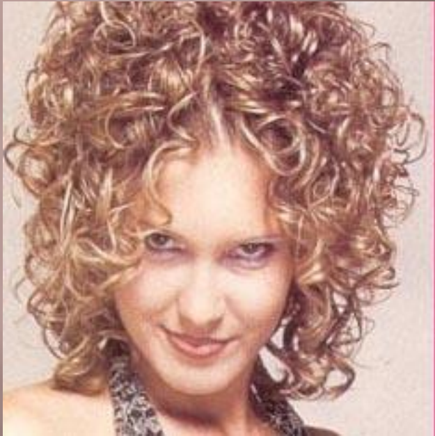
Her hair is curly and fair.