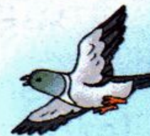
a bird [ə 'bɜ:d]