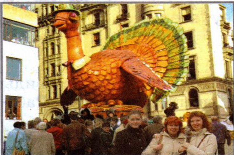
Tom Turkey [,tɒm 'tʒ:ki]