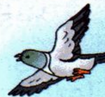
a bird [ə 'bɜ:d]