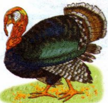
a turkey [ə 'tʒ:ki]