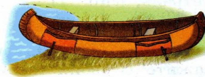
a boat [ə 'bəʊt]