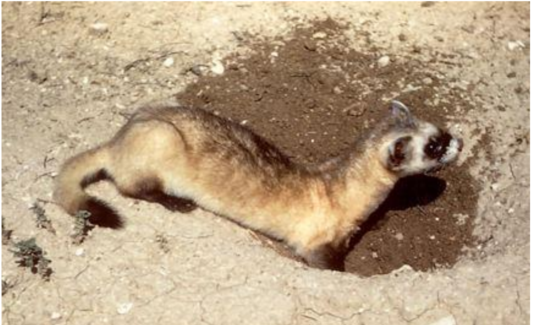
black footed ferret