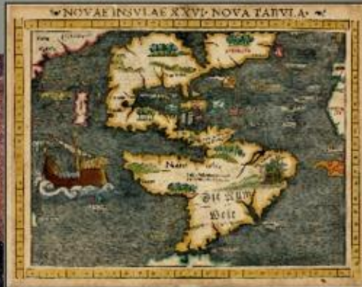
The first map of America

It was named after Amerigo Vespucci, another famous sailor.