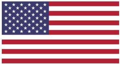
Flag of United States