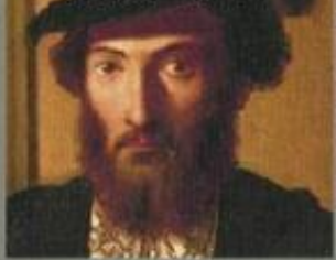
Amerigo Vespucci 1454-1512

The USA was discovered in 1492 by Christopher Columbus.