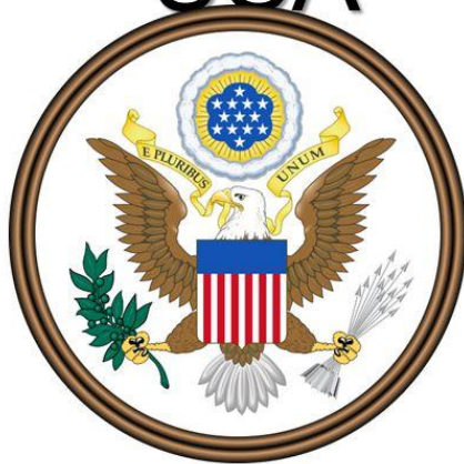
Great Seal of the United States

National animal: Bald eagle National motto: "In God We Trust "