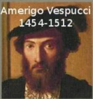
Amerigo Vespucci 1454-1512

The USA was discovered in 1492 by Christopher Columbus.