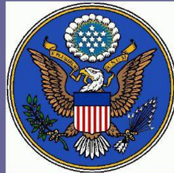
US Coat of Arms: The Great Seal of the United States