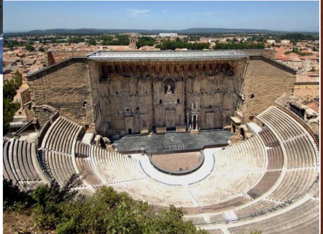
Théâtre Antique in Orange, Vaucluse