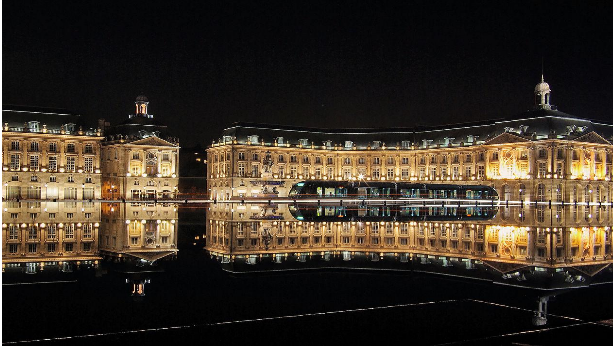
The Capitole de Toulouse by night