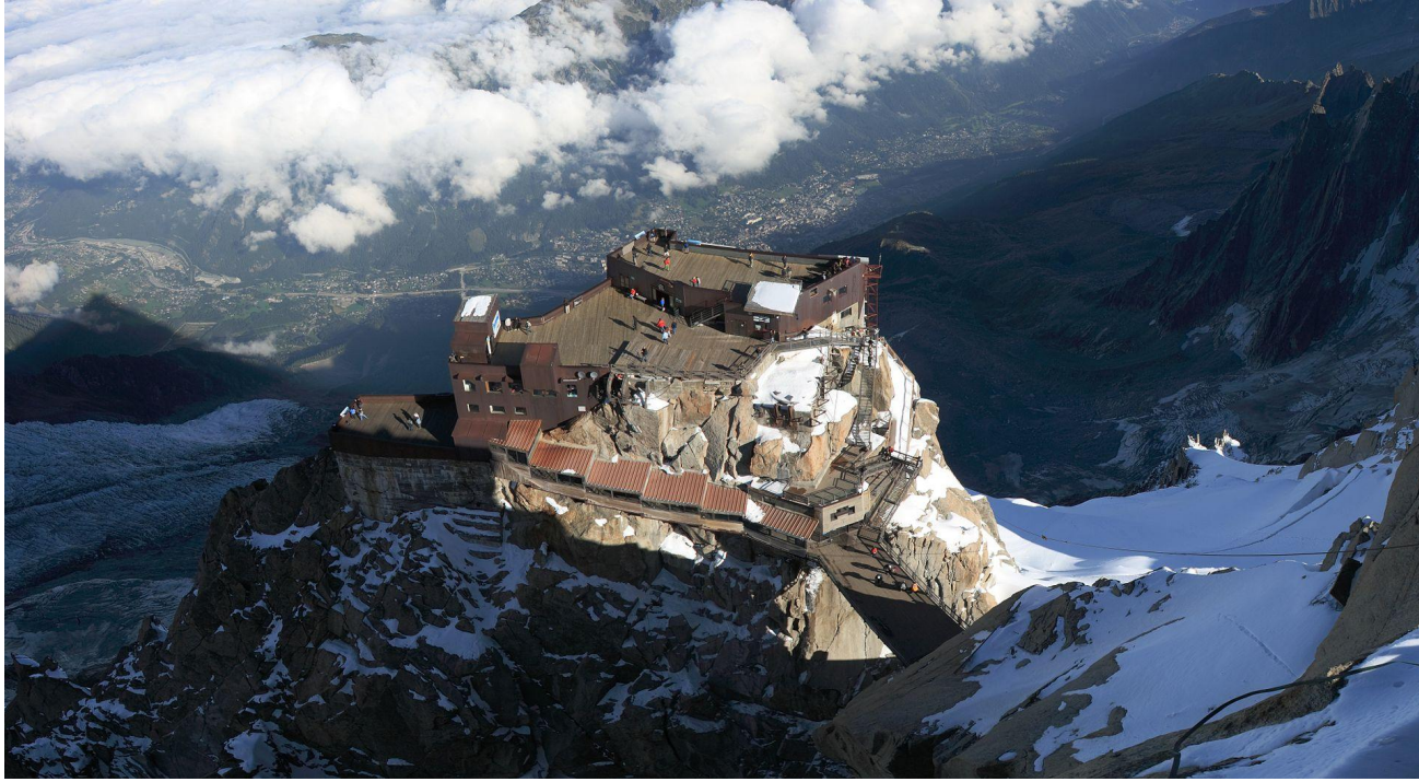
Aiguille du Midi in the French Alps.