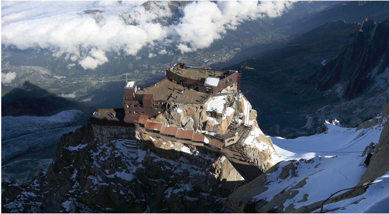
Aiguille du Midi in the French Alps.