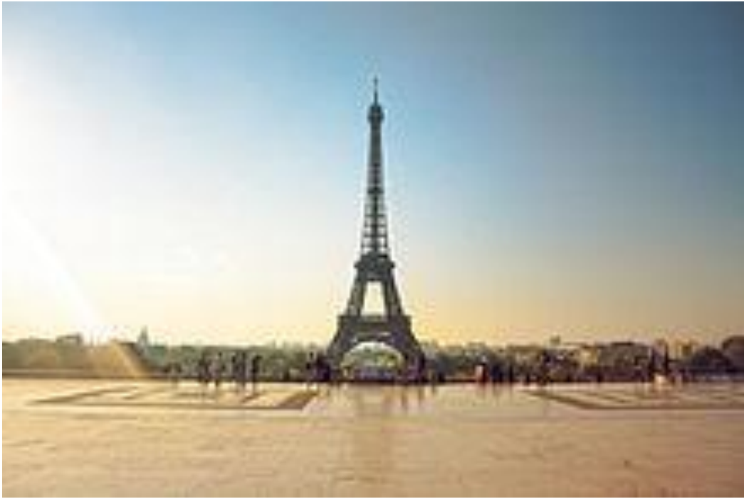
The Eiffel Tower from the Place du Trocadéro