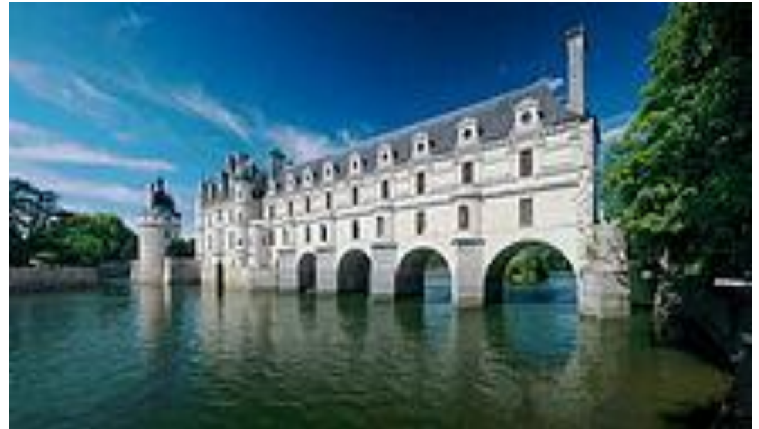
Château de Chenonceau (Loire Valley)