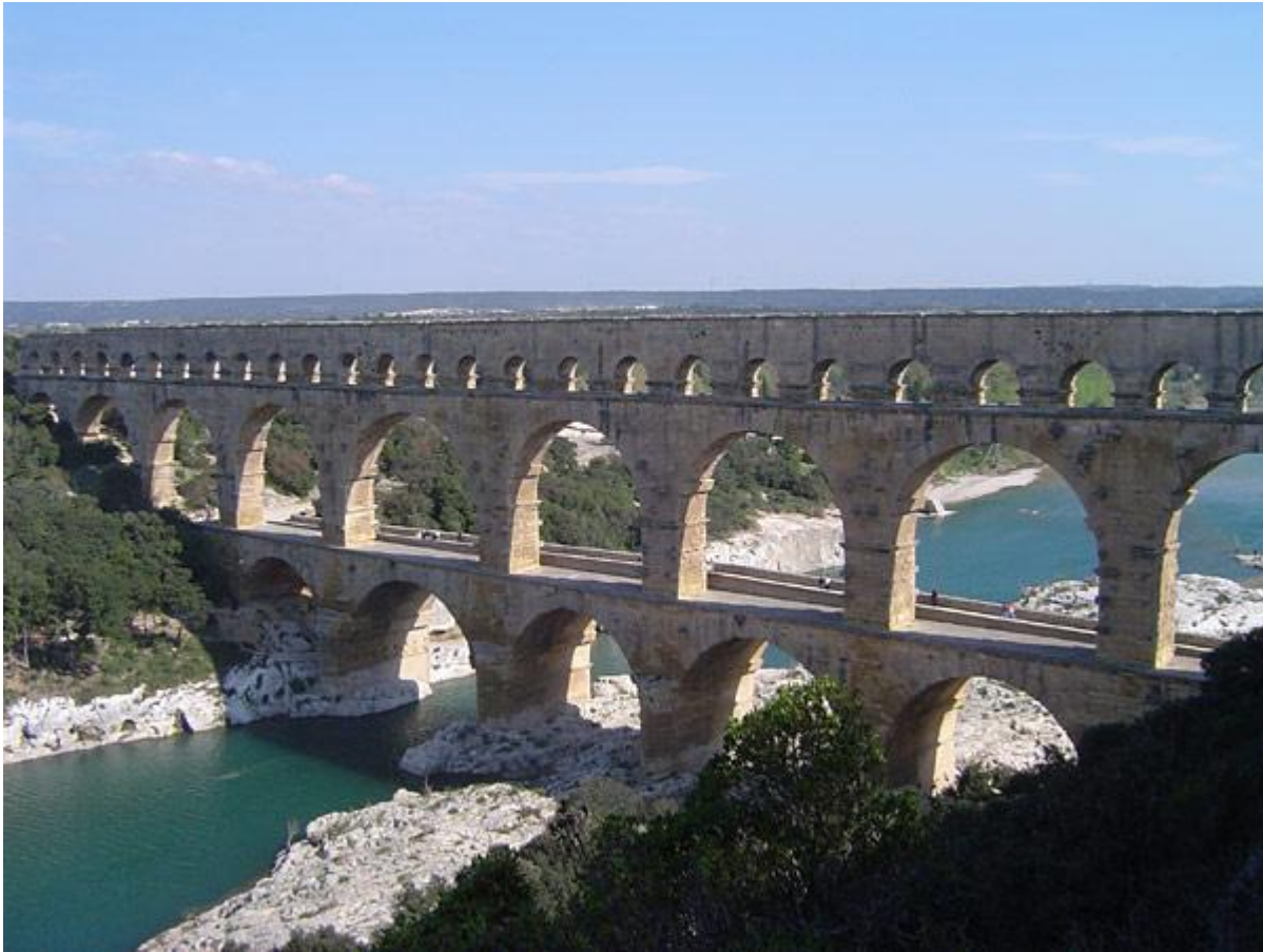
The Pont du Gard, a Roman vestige