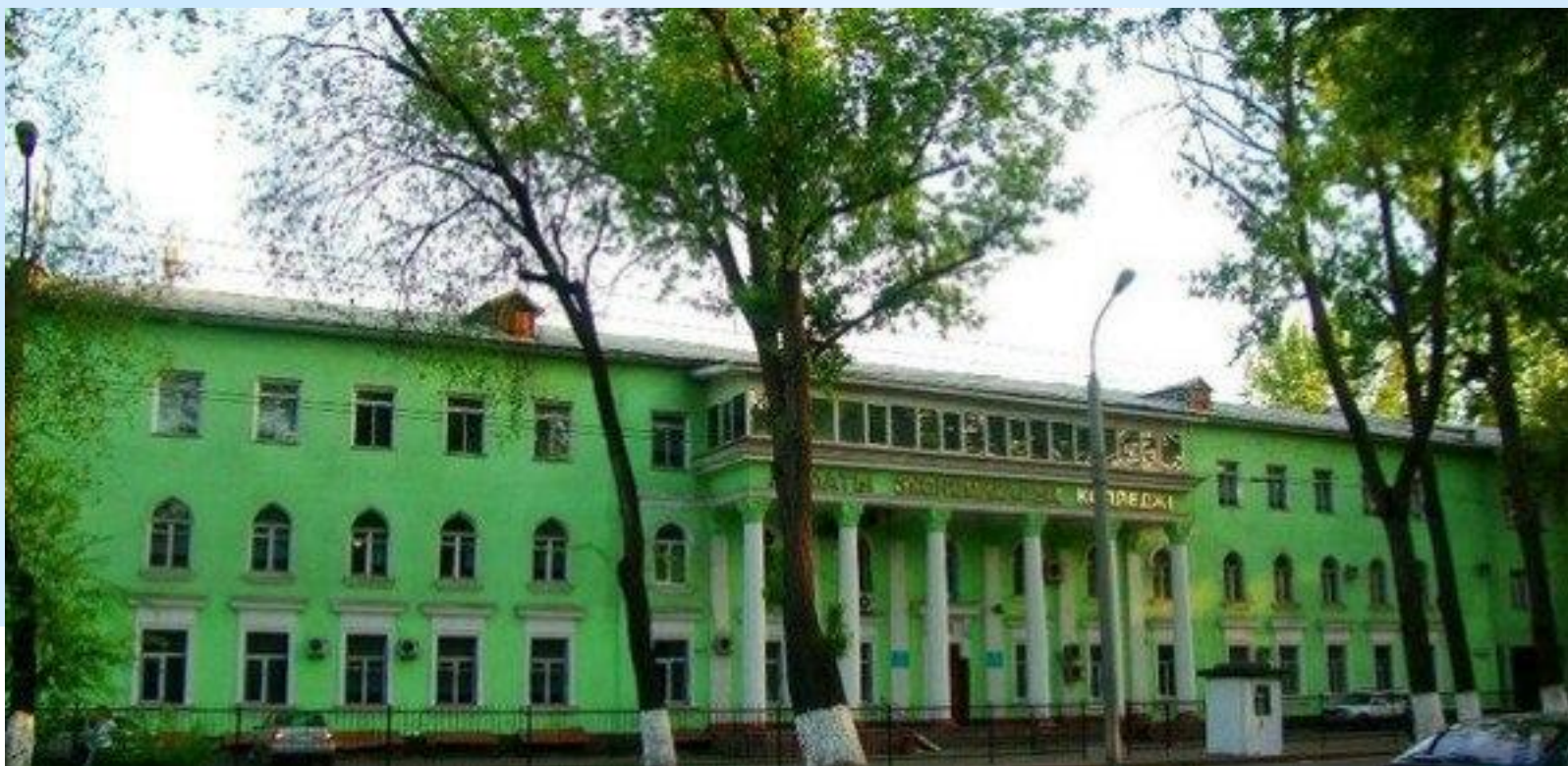
* ALMATY ECONOMIC COLLEGE