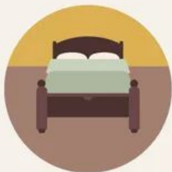
Making a bed