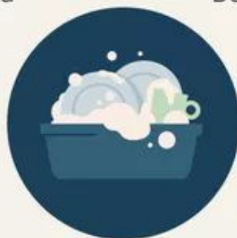
Doing the dishes