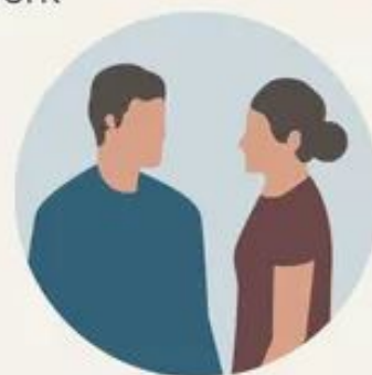
Giving someone advice