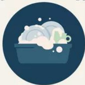
Doing the dishes