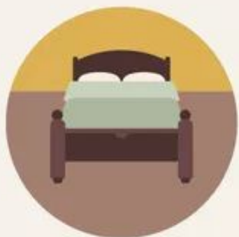
Making a bed