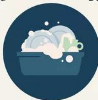
Doing the dishes