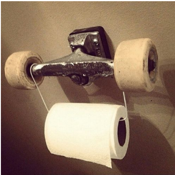
This is so sick! skatermemes