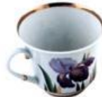
CUP [kʌp] чашка