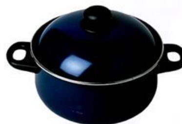
POT [pɒt] кастрюля