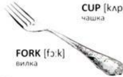
FORK [fɔ:k] вилка