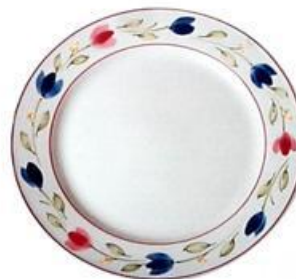
PLATE [pleɪt] тарелка