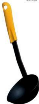
LADLE ['leɪdəl] половник