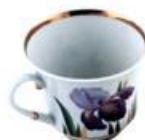
CUP [kʌp] чашка