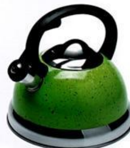
KETTLE ['ketəl] чайник