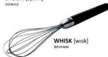
WHISK [wɪsk] венчик