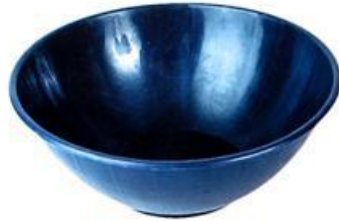
BOWL [bəʊl] миска