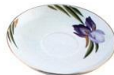
SAUCER ['sɔːsə] блюдец