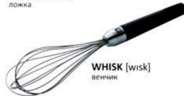
WHISK [wɪsk] венчик