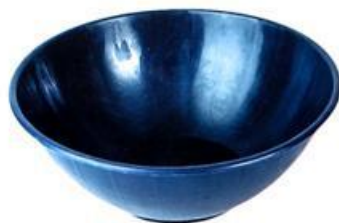
BOWL [bəʊl] миска