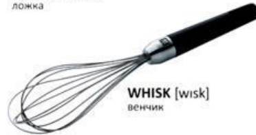
WHISK [wɪsk] венчик