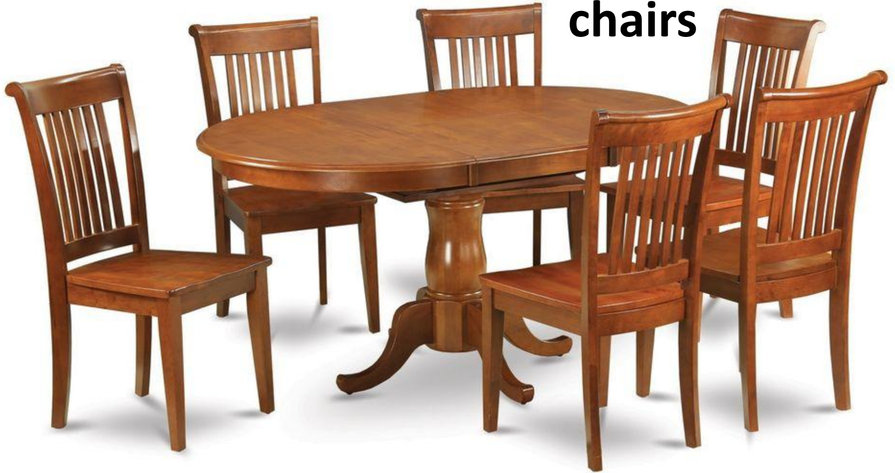
Table and chairs