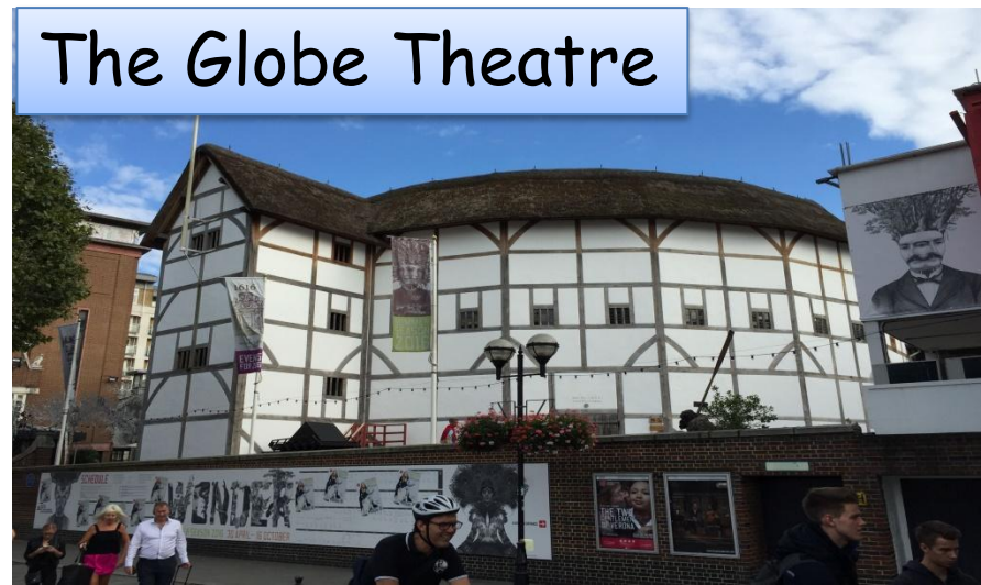
The Globe Theatre