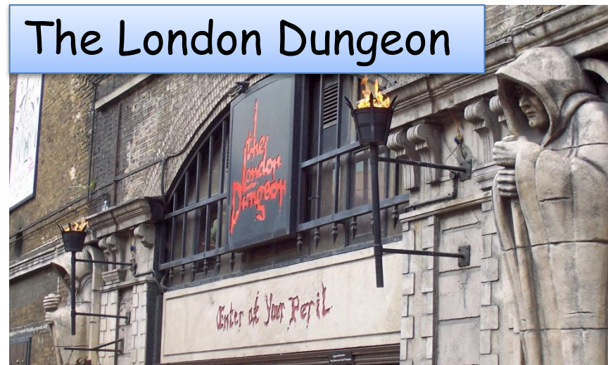
The London Dungeon