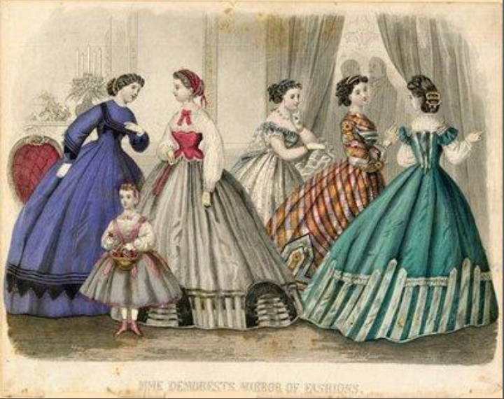
FINE DRESSERS' MIRROR OF FASHIONS.