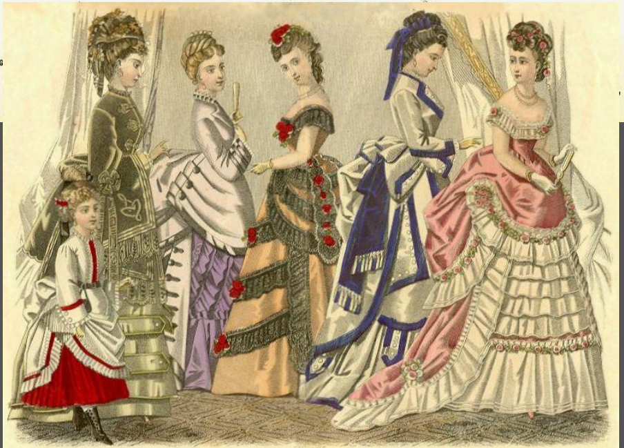
FIGURE No. 54 H.