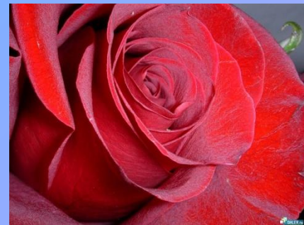
d. a red rose