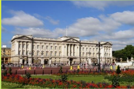
a. Buckingham Palace