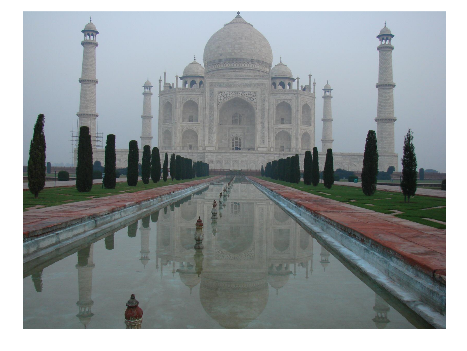
OUTSIDE, THERE IS A VERY BEAUTIFUL GARDEN WITH FOUR POOLS.