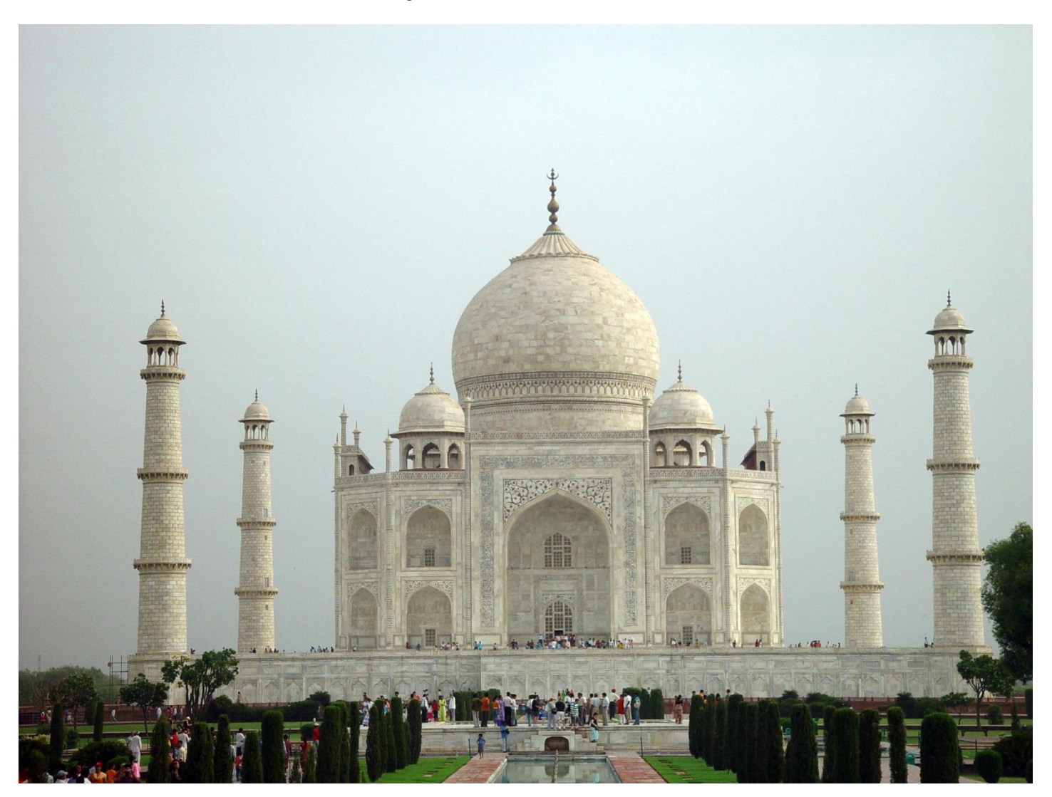
THE TAJ MAHAL IS IN AGRA. IT IS ONE OF THE EIGHT WONDERS OF THE MODERN WORLD.