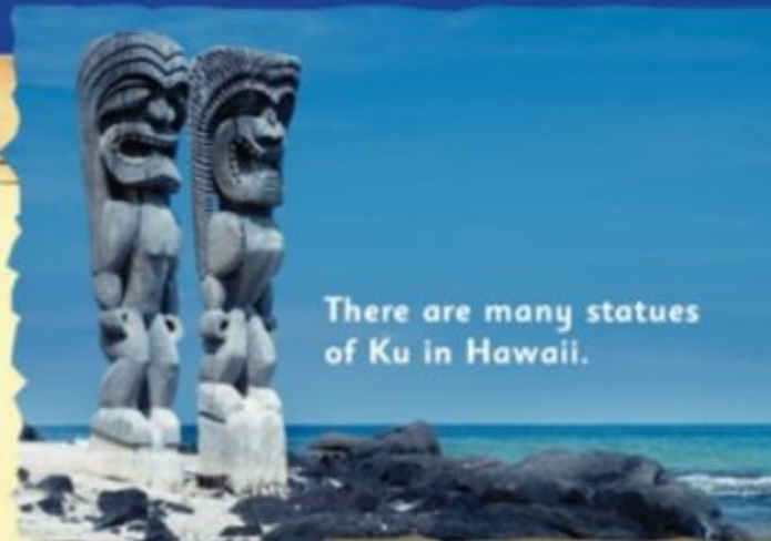
There are many statues of Ku in Hawaii.