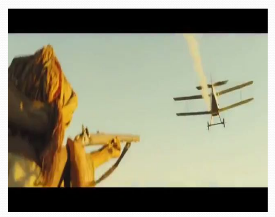
The man in traditional clothes shoots down a plane