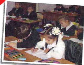
in the classroom