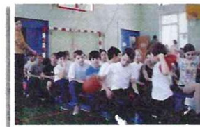
in the gym

Children in Russia spend 4 years in primary school. Most schools in Russia have numbers, not names, and in some schools students wear uniforms.