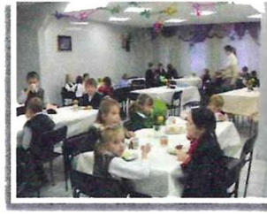
in the canteen