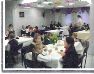
in the canteen