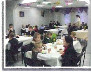
in the canteen