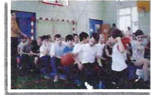
in the gym

Children in Russia spend 4 years in primary school. Most schools in Russia have numbers, not names, and in some schools students wear uniforms.