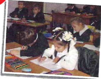
in the classroom