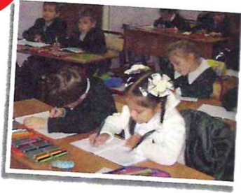
in the classroom