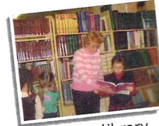
in the library