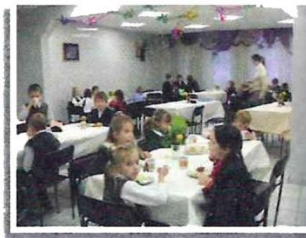
in the canteen