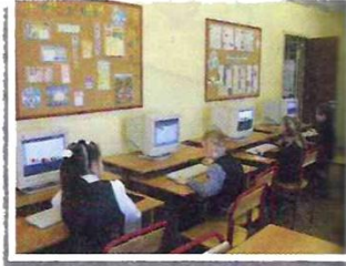
in the computer room