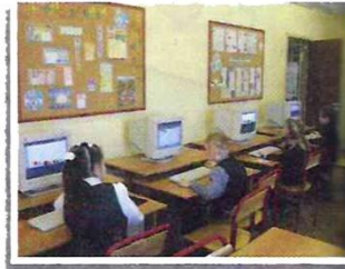
in the computer room