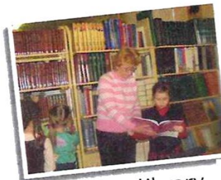
in the library