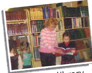
in the library