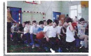
in the gym

Children in Russia spend 4 years in primary school. Most schools in Russia have numbers, not names, and in some schools students wear uniforms.