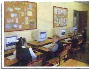
in the computer room