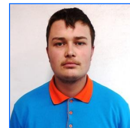
Sykurinets M. Line feeder