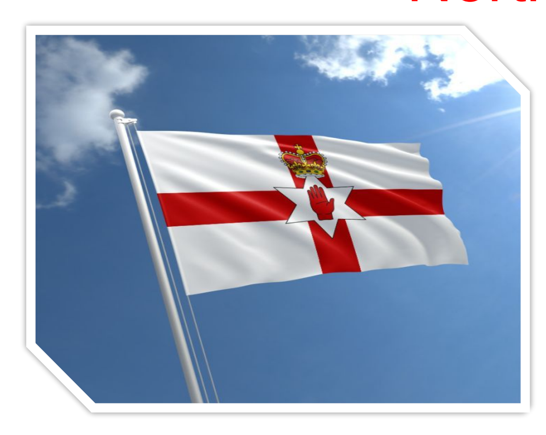
Belfast is the capital of Northern Ireland