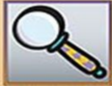
Figure out what it really means from clues in the text