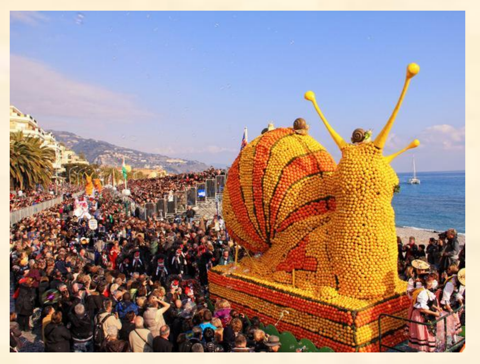
Every February to March, the people of Menton celebrate Lemon Festival.