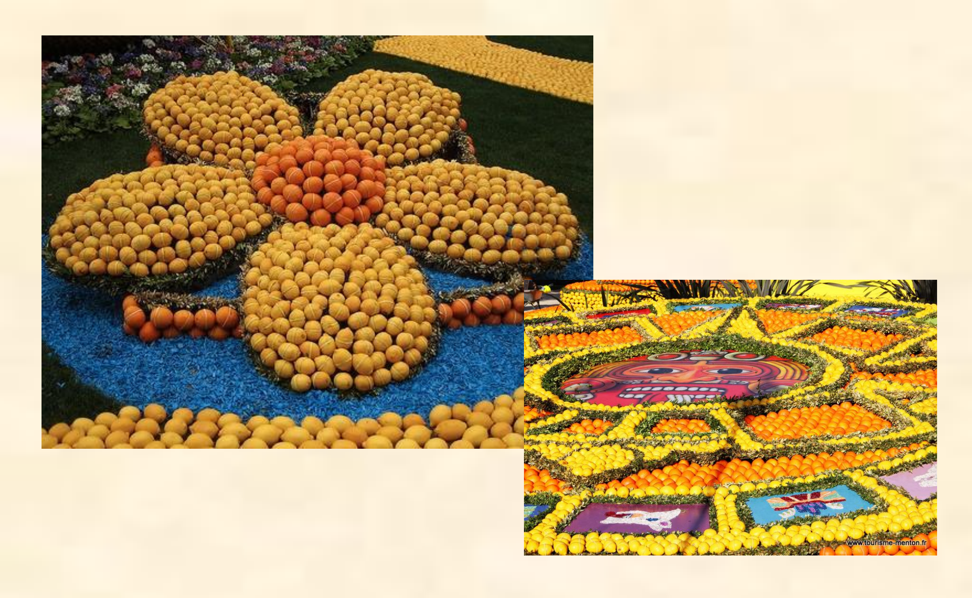
You can visit a daily Citrus Exposition.