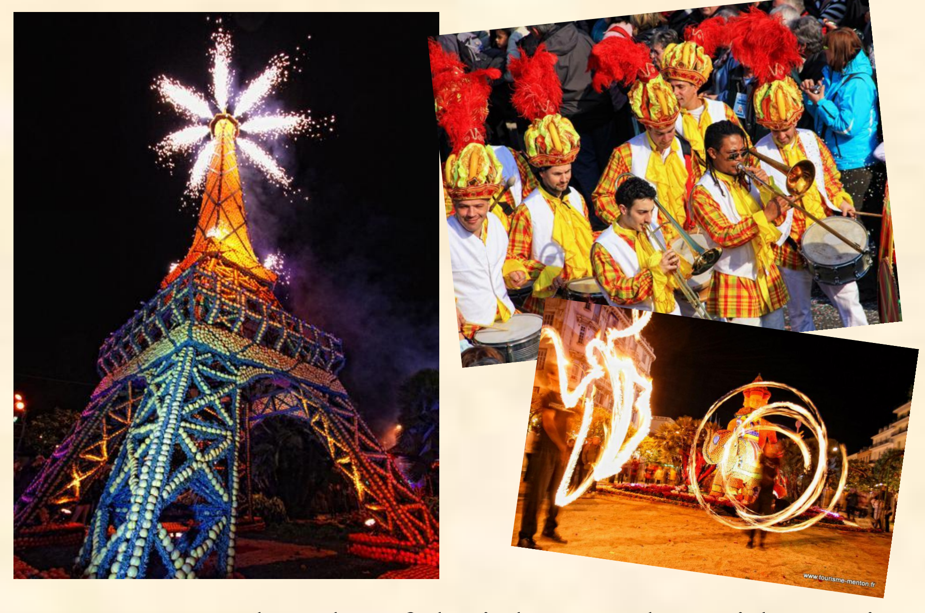
You can watch colourful night parades with music, dancers and fireworks on Thursdays.