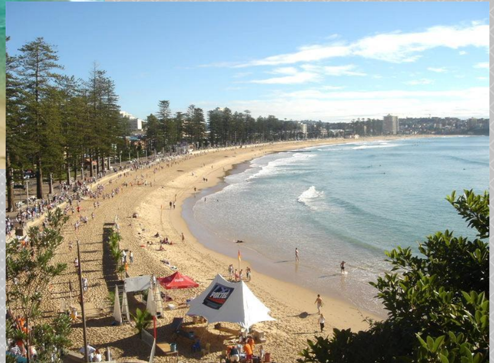
Bondy Beach & Manly Beach