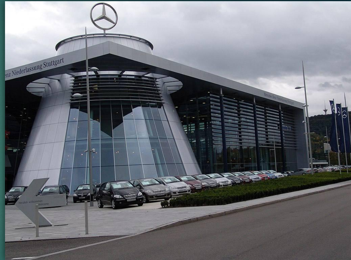
Mercedes Benz headquarters in Stuttgart

Mercedes benz - a trademark and a company of the same name a manufacturer of premium cars, trucks, buses and other vehicles that are part of the German concern "Mercedes-Benz Group". is one of the most famous automotive brands in the world. Mercedes-Benz is headquartered in Stuttgart, Germany.