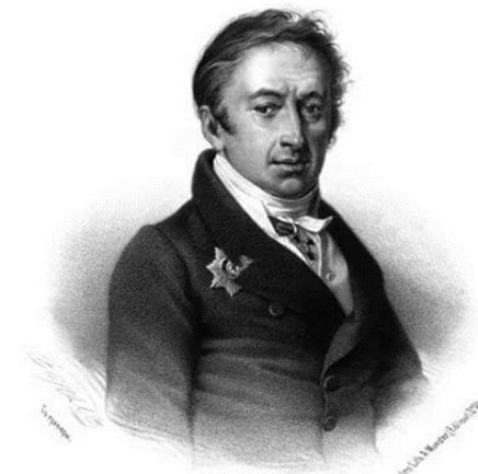
Figure 1. Karantzine. Историческое изображение N. KARANTZINE.