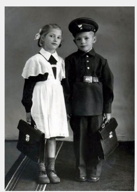
School uniform in the Russian Empire

In 1948 wearing school uniform became obligatory. It was said that the uniform made children more tidy and showed the absence of the classes division.