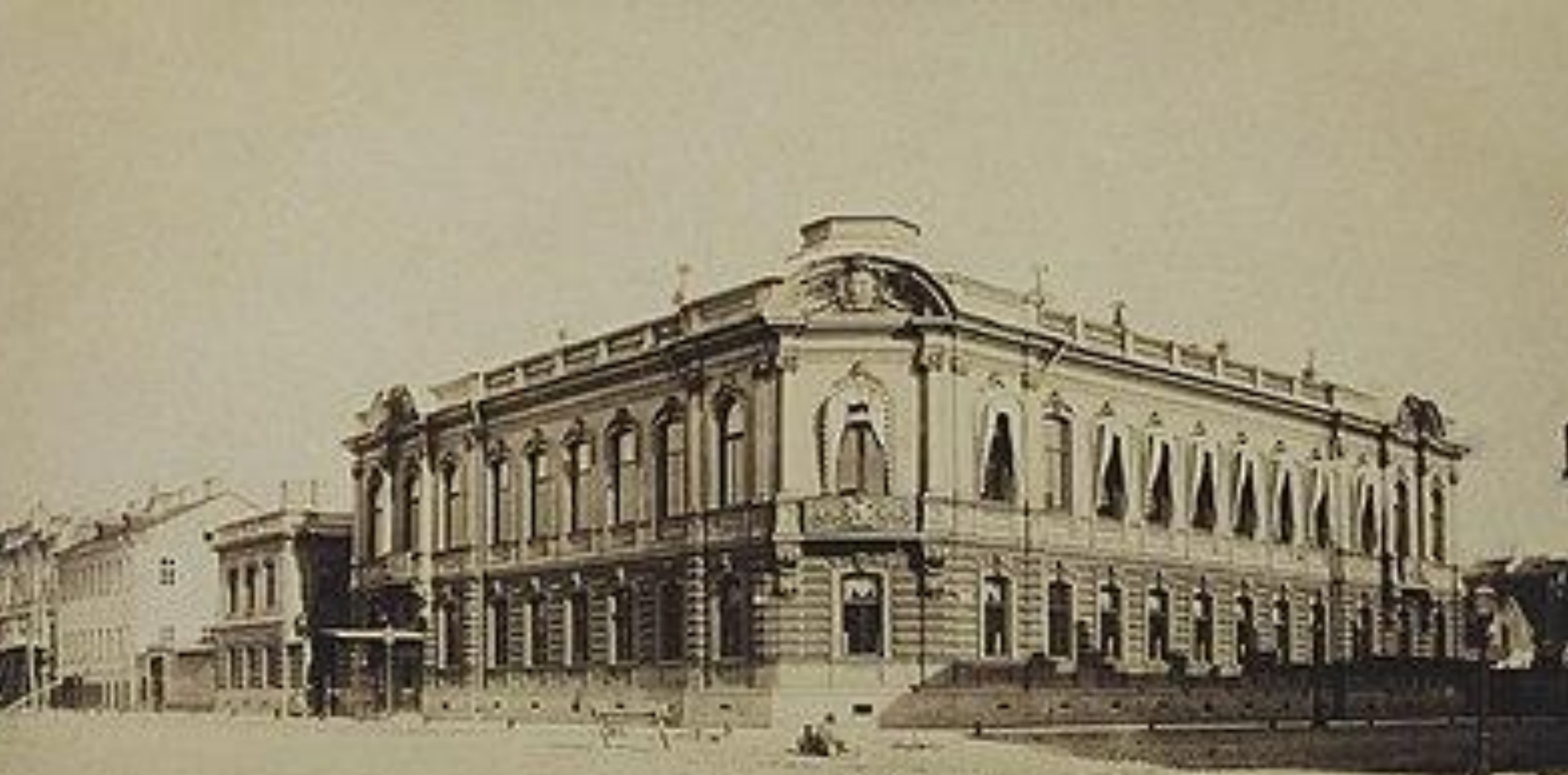
Первый музыкальный техникум