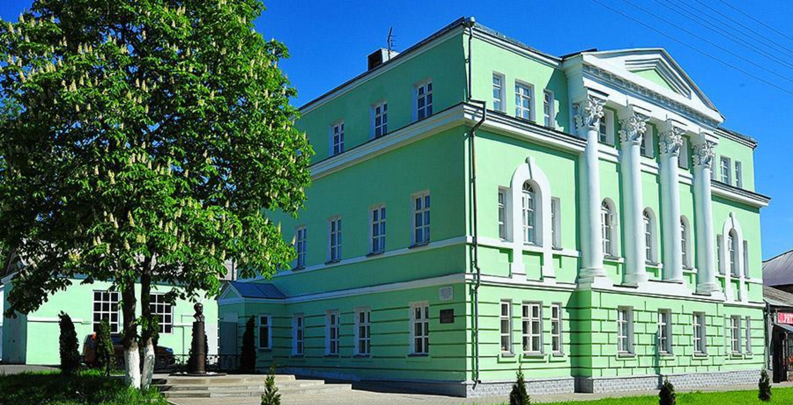
Дом композитора в г. Фатеж