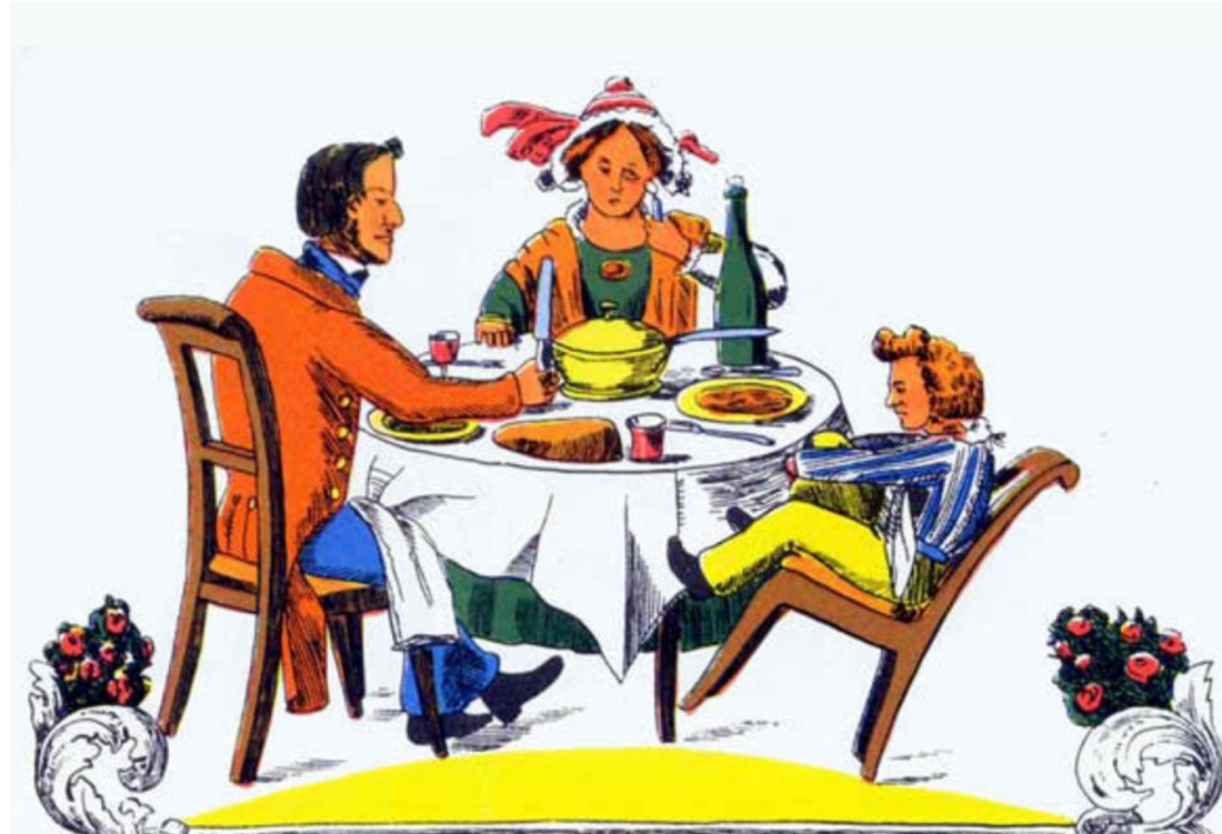
Fidgety Phil, often seen as an allegory for ADHD. Illustration from a book written by physician Heinrich Hoffmann.

“The Dreadful Story of Pauline and the Matches”