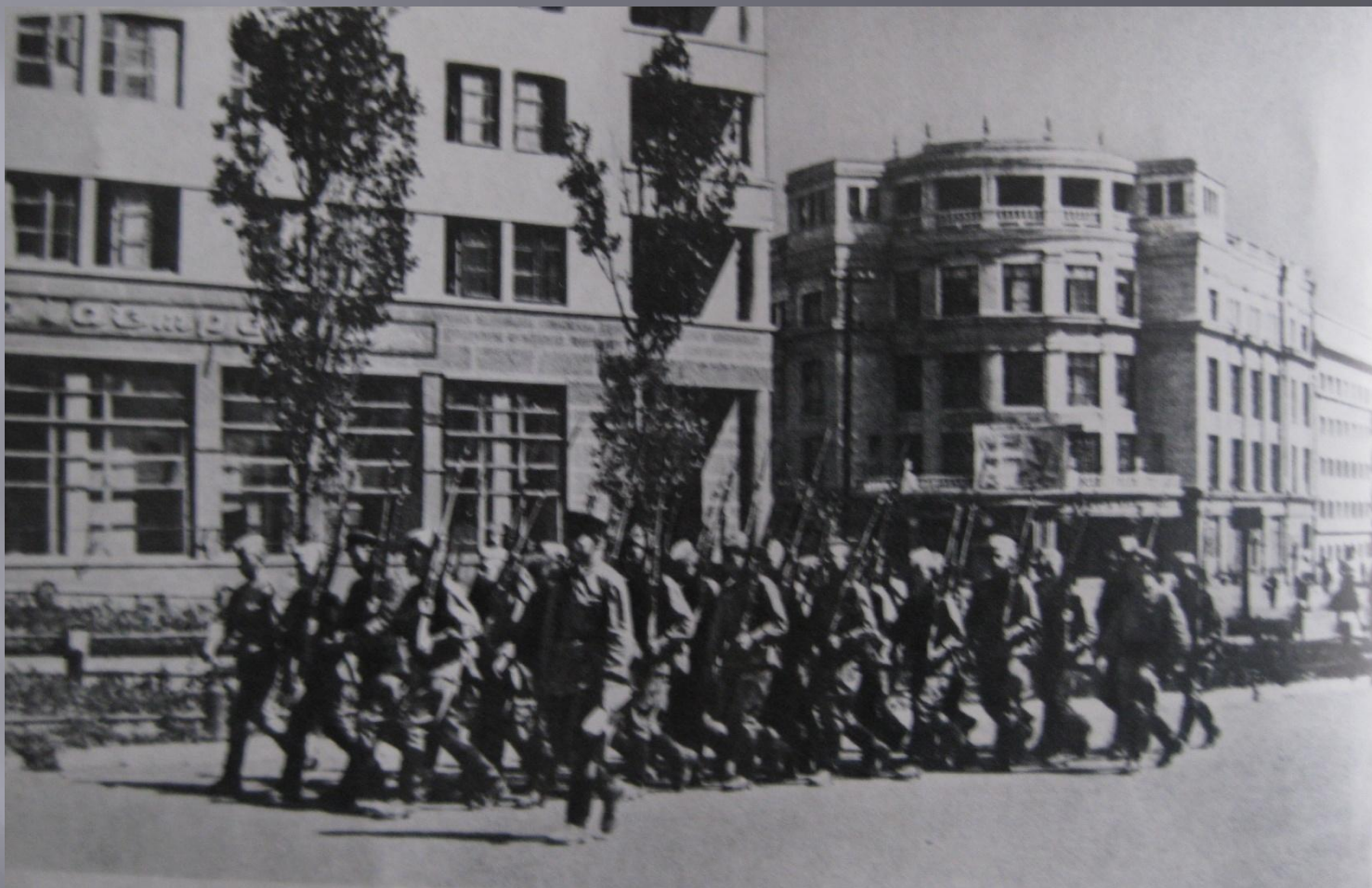
Panorama of front-line Stalingrad June 1942