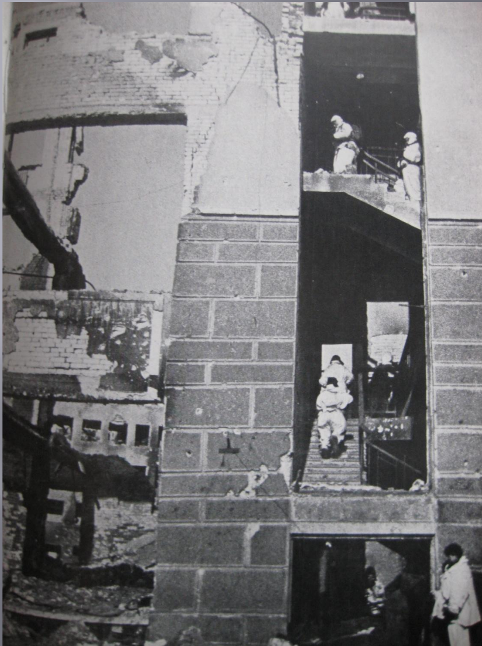
Fighting for a house