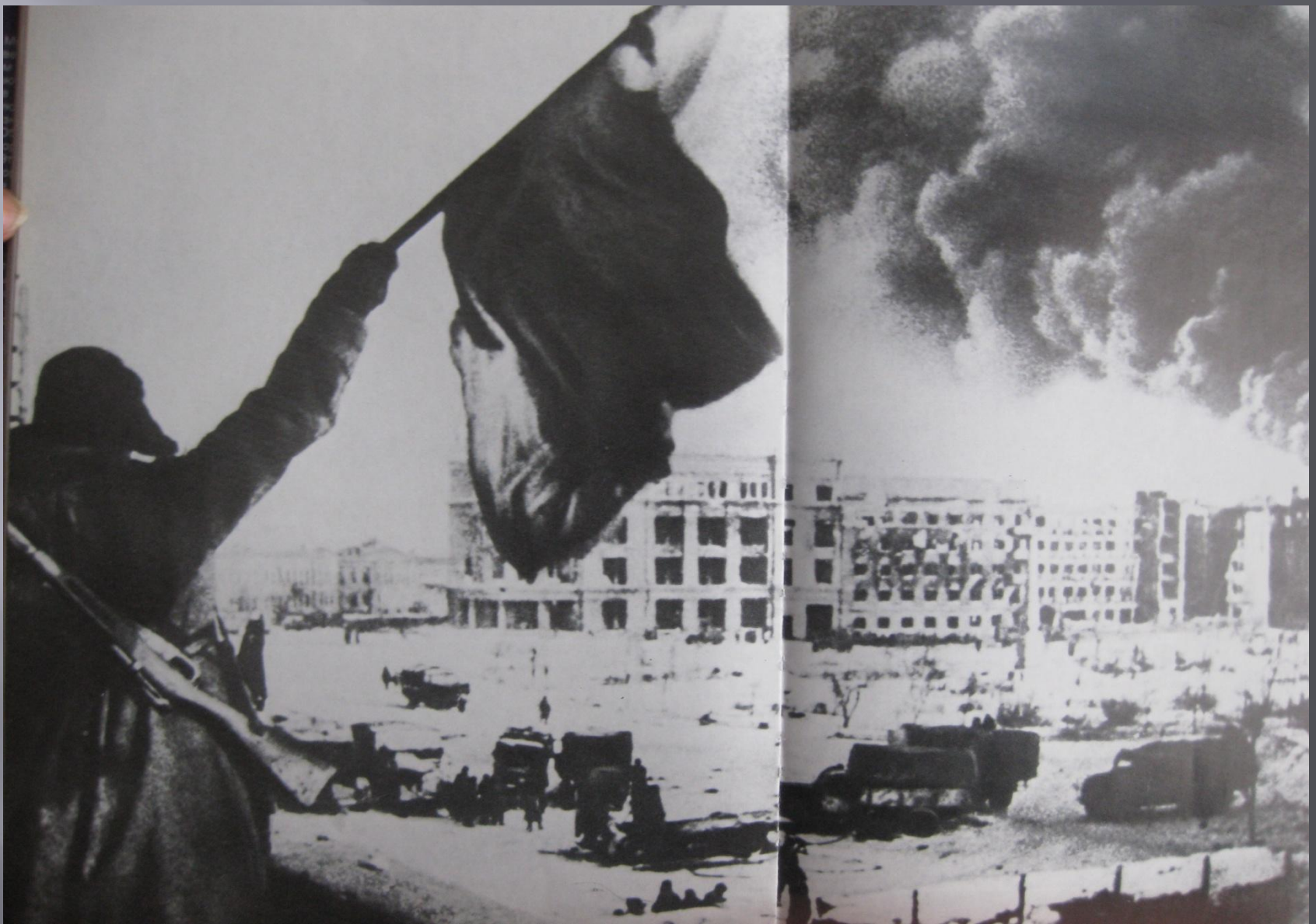
Victory banner raised over Stalingrad