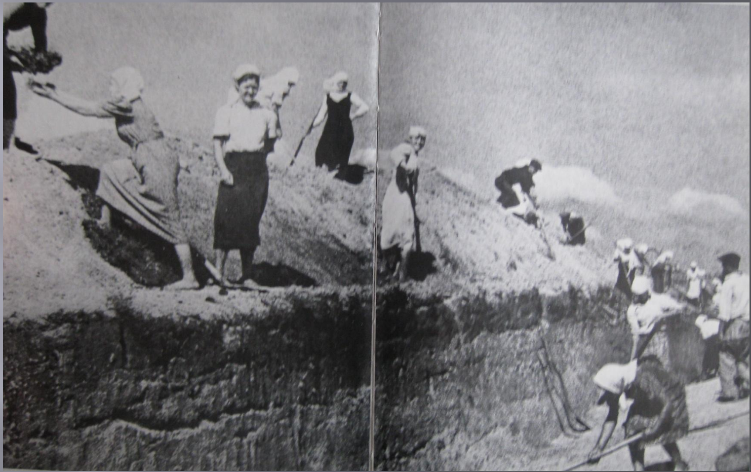
The people of Stalingrad fortify their city