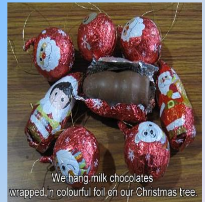
We hang milk chocolates wrapped in colourful foil on our Christmas tree.