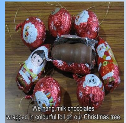
We hang milk chocolates wrapped in colourful foil on our Christmas tree.