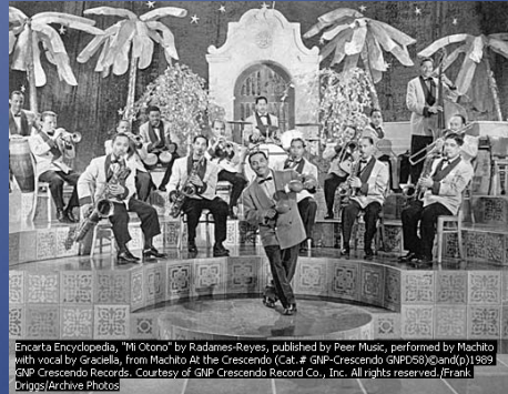
Encarta Encyclopedia, "Mi Otono" by Radames-Reyes, published by Peer Music, performed by Machito with vocal by Graciela, from Machito At the Crescendo (Cat. # GNP-Crescendo GNPD58)©and(p)1989 GNP Crescendo Records. Courtesy of GNP Crescendo Record Co., Inc. All rights reserved.