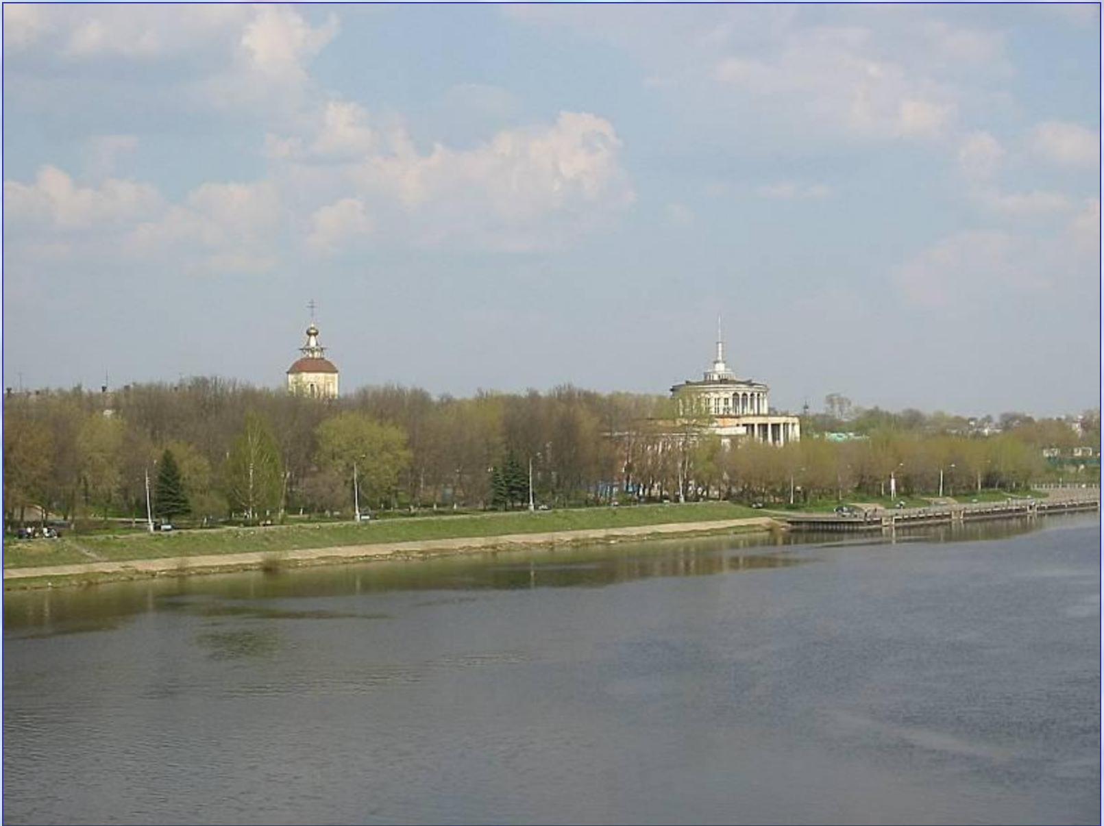
The Volga river