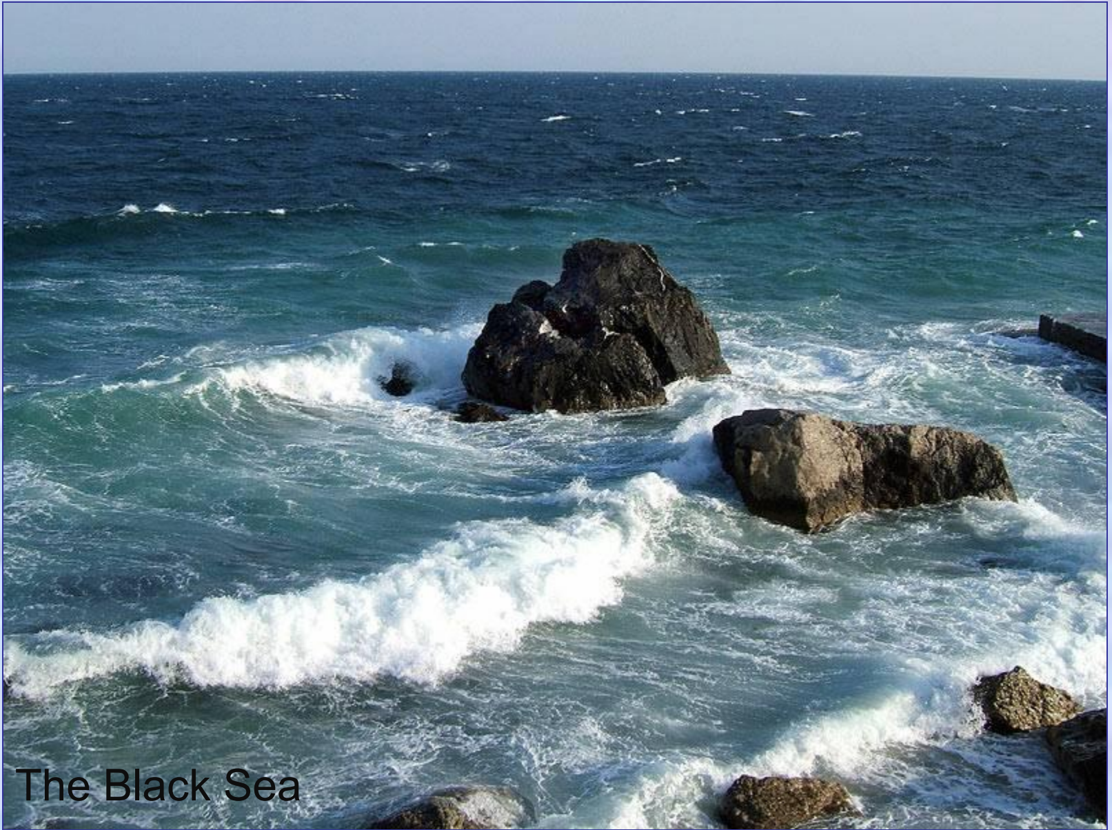
The Black Sea