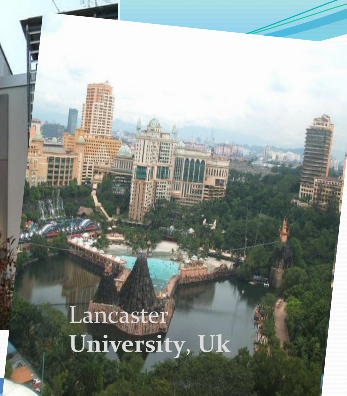
Lancaster University, Uk