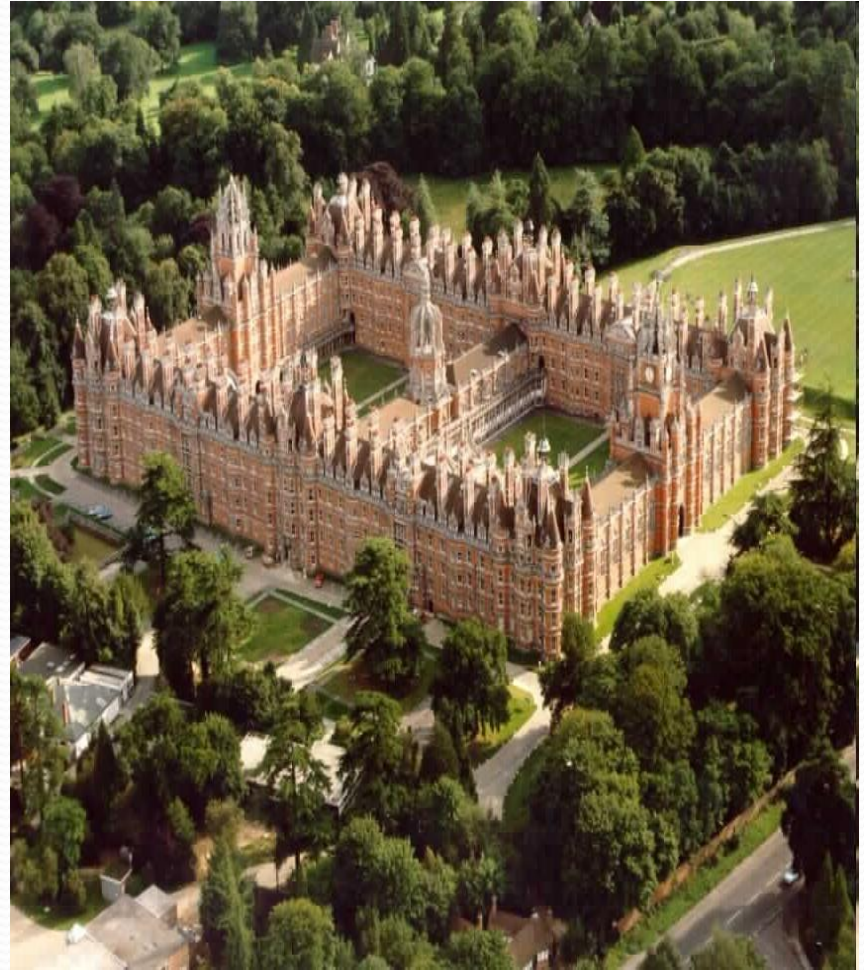
University of London.

Following two years of study, students may take A-Level (short for Advanced Level) examinations, which are required for university entrance in the UK.