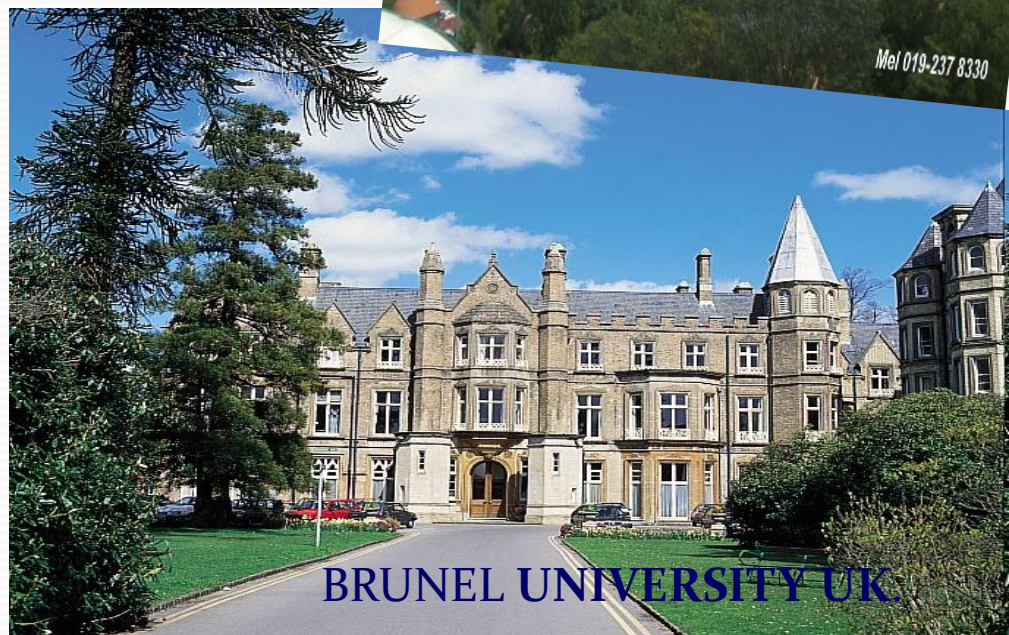
BRUNEL UNIVERSITY UK