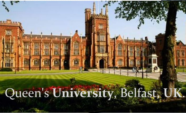
Queen's University, Belfast, UK.