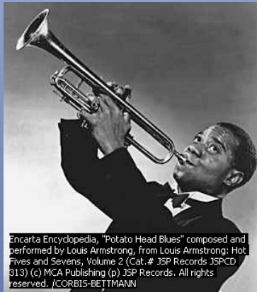
Encarta Encyclopedia, "Potato Head Blues" composed and performed by Louis Armstrong, from Louis Armstrong: Hot Fives and Sevens, Volume 2 (Cat.# JSP Records JSPCD 813) (c) MCA Publishing (p) JSP Records. All rights reserved.