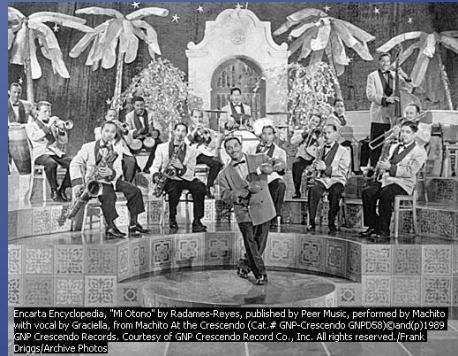
Encarta Encyclopedia, "Mi Otono" by Radames-Reyes, published by Peer Music, performed by Machito with vocal by Graciela, from Machito At the Crescendo (Cat.# GNP-Crescendo GNPD58)©and(p)1989 GNP Crescendo Records. Courtesy of GNP Crescendo Record Co., Inc. All rights reserved.