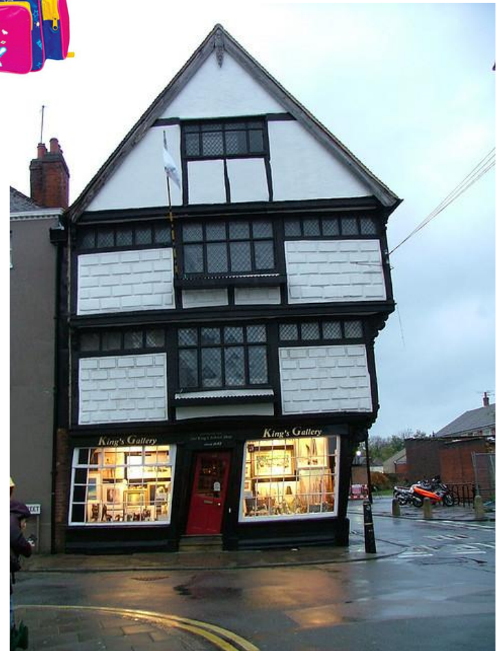
The Old King's School Shop 6