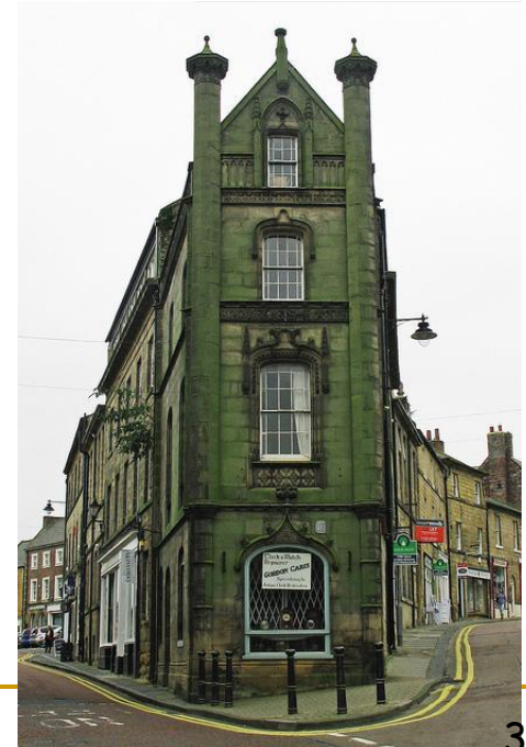
The Tall Green Shop