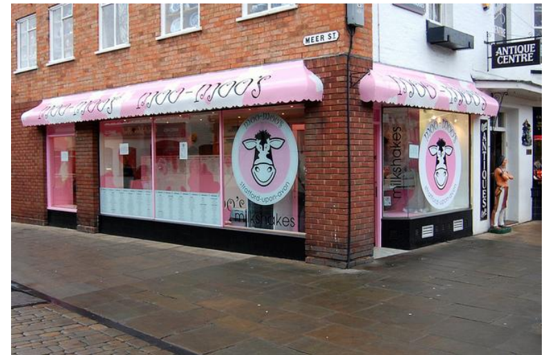
Moo-Moo's Milk Shake Shop 4