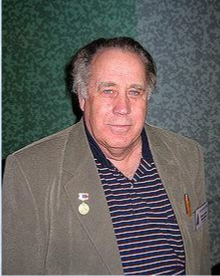
Vladislav Krapivin is the Russian writer, author of the books for children and about the children.