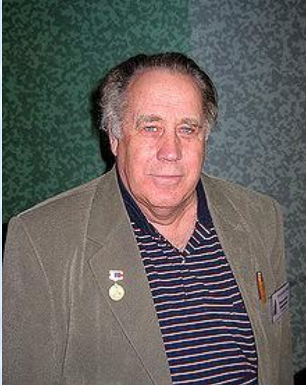
Vladislav Krapivin is the Russian writer, author of the books for children and about the children.