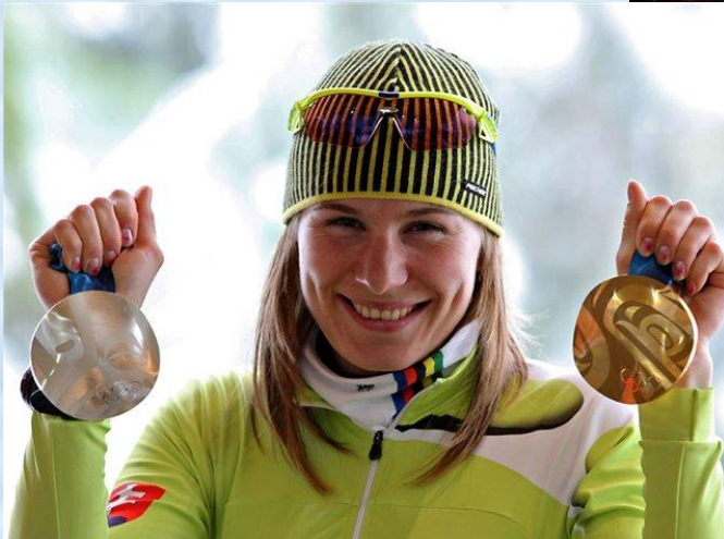
Anastasia Kuzmina, the Olympic champion