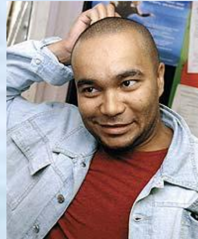
Grigory Syatvinda, Russian film and theater actor