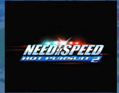
Playing computer games